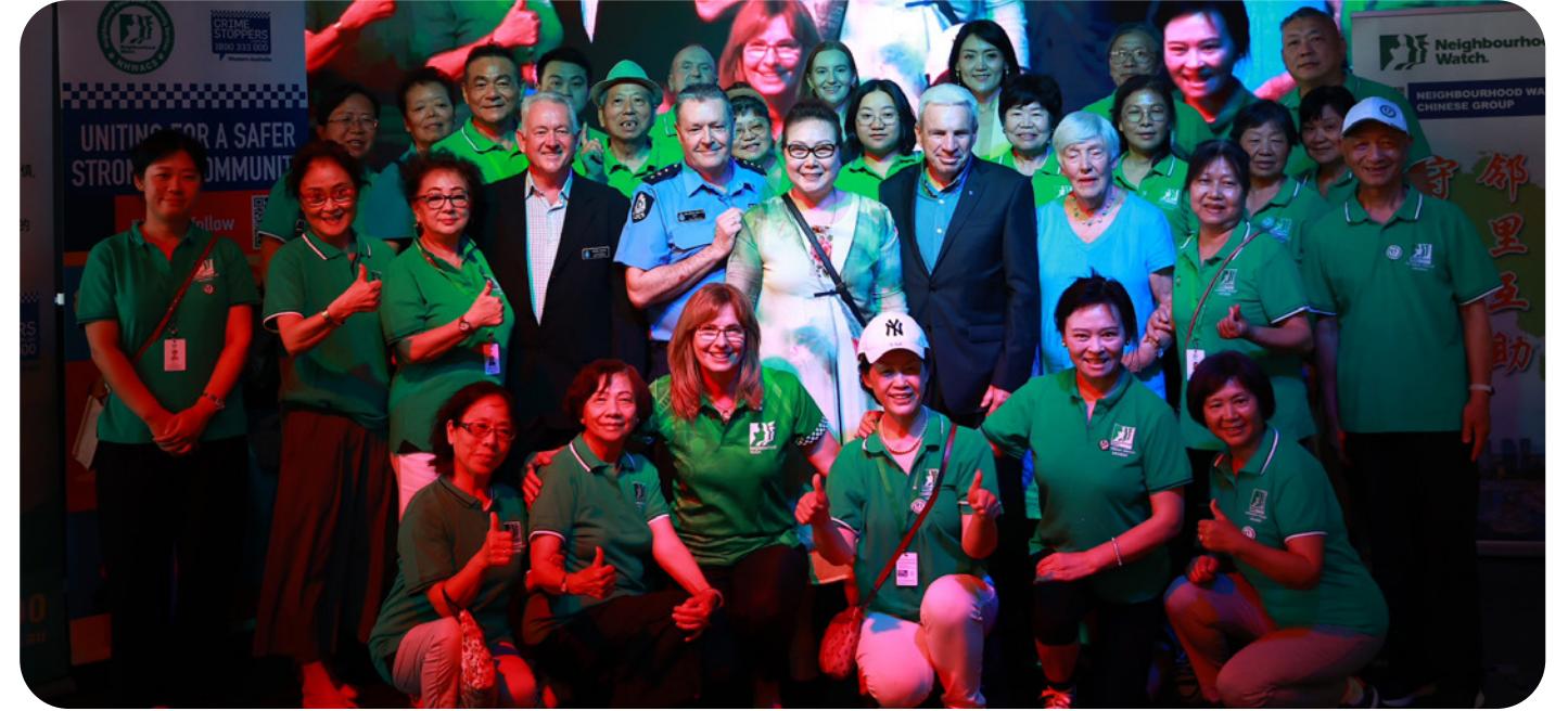
NHWA members with members of the NHW Asian Group at the Perth event

Together, they then rode from the school to a live radio broadcast by the ABC held in November 2023 to promote the bike library.