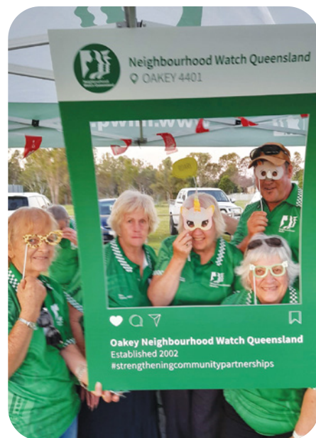
The awesome Oakey NHW members having fun and sharing safety information with the community at Oakey Santa Fair