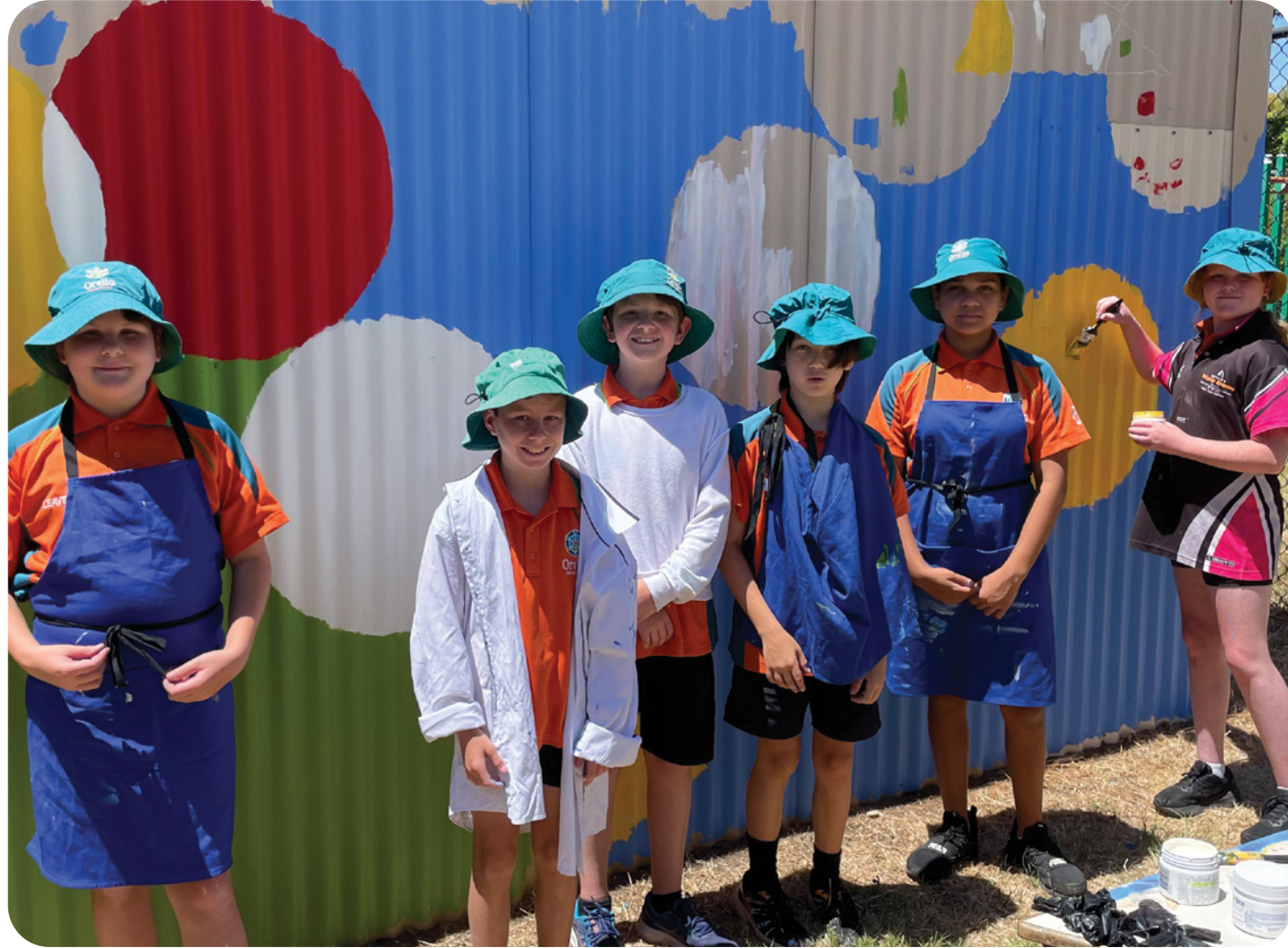
Junior Neighbourhood Watch students brighten up the Orelia Bike Library