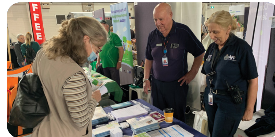
ACT Policing engaging with the public alongside NHW volunteers