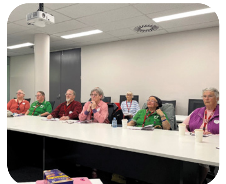
Participants at Get Online Week at the ABC Centre, Hobart

good coffee in easily accessible venues guarantees the intended outcome of improving police/community relationships.