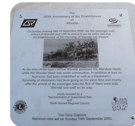
The plaque on top of the plinth that contains the time capsule