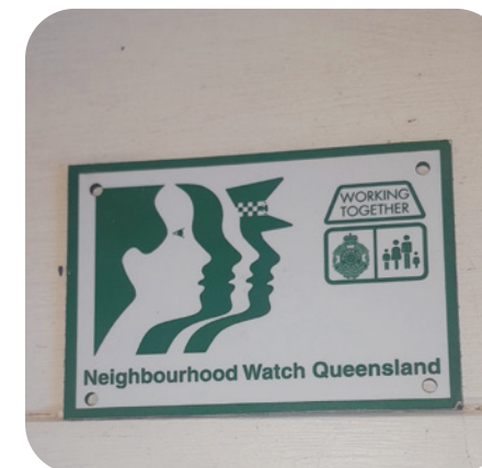
The NHW Queensland letterbox sign added to the time capsule