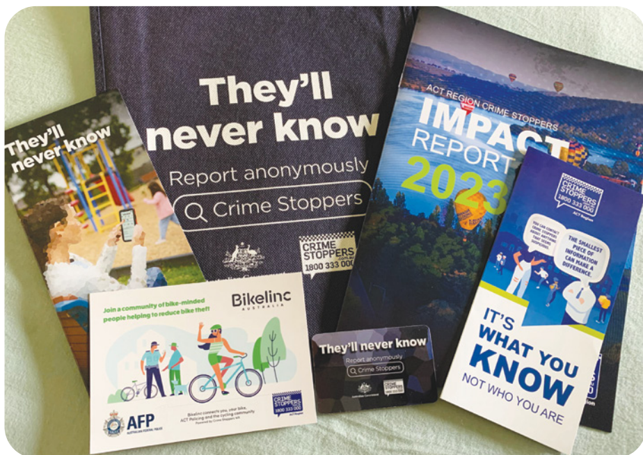
Crime Stoppers resources