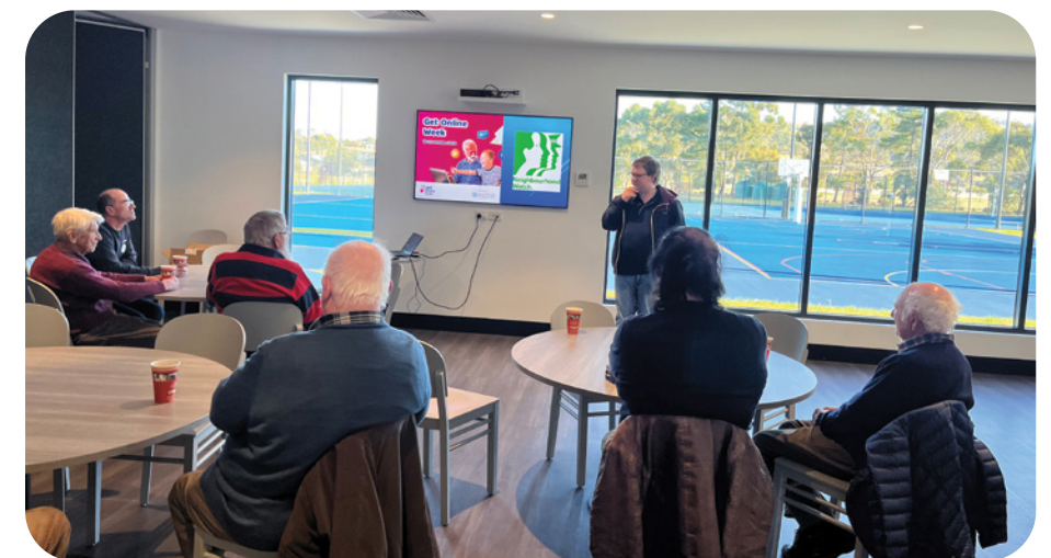
Get Online Week at the South East Stadium in Sorell

Good Things Foundation and access to their Be Connected grants for Get Online Week which our groups use to deliver advice to older members about the benefits of being online. These events not only help reduce fear and anxiety about using modern technologies, but are also invaluable social opportunities for people to connect and leave better informed and more confident than when they arrived.