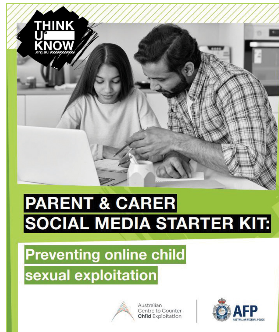
ThinkUKnow parent and carer social media starter kit