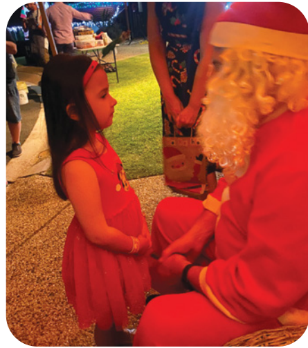
The children loved catching up with Santa