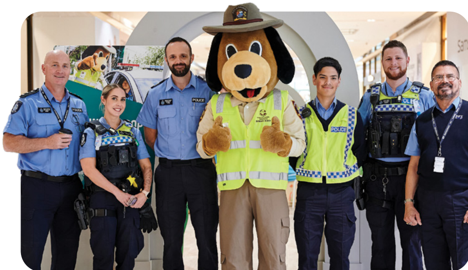
Officers from Cannington Police Station at the City's 'Coffee with a Cop' event at Westfield Carousel, Cannington

The month was very successful, with over 1,300 surveys completed by the community.