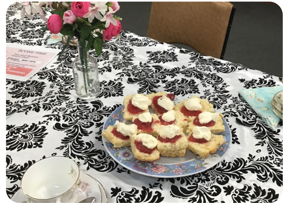
Homemade scones with real Tasmanian fresh jam and cream!