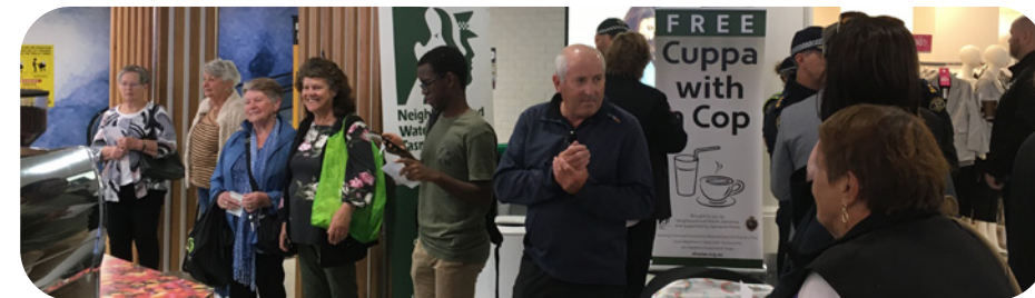
Cuppa with a Cop at Burnie Plaza