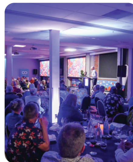
During the Conference Dinner Gordon Tietjens talks to the group about good leadership, how to create a positive culture, and what it takes to motivate a team

the New Zealand Police, right from the Police National Headquarters (PNHQ) through to grassroots level; as well as a contingent from Neighbourhood Watch Australasia who joined in collaborative conversations with both the New Zealand Police and Neighbourhood Support Coordinators from across New Zealand.