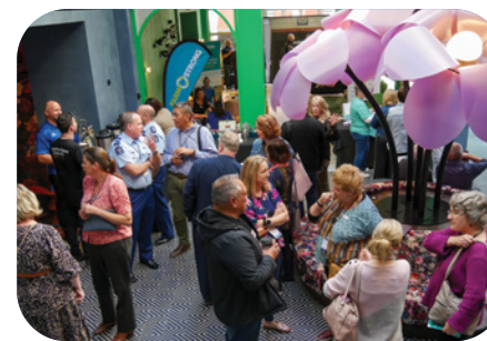
Networking session in action

NSNZ were also thrilled to have a group of passionate delegates from