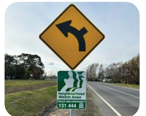
Exit left for the best scones in town!

And if you want to hear more good news, readers will no doubt be happy to also hear that Jo was a 2023 finalist in the Black Pepper search for Australia's kindest person.