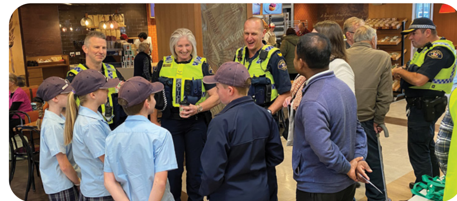
Cuppa with a Cop at Claremont Plaza