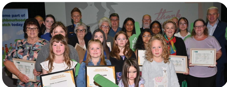
NHW Award recipients and Calendar Drawing Competition Winners at the Country Club, Launceston

Each year Neighbourhood Watch in Tasmania (NHWT) hosts its Awards Ceremony in conjunction with the Annual General Meeting (AGM) at the Country Club in Launceston.