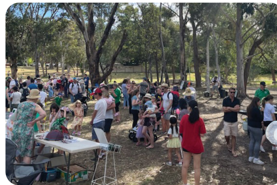
Over 200 residents attended the NHW Week event at Farrer Adventure Nature Park