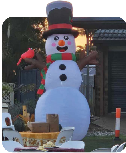
Frosty the Snowman made an appearance in Daisy Hill