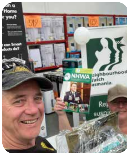
Our volunteers from the Clarence Plains Cluster making a profit from our Bunnings Raffle