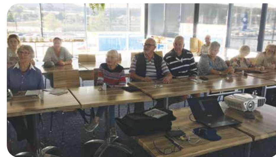
Oakdowns class is in at the Bellerive Yacht Club

Every year that NHW in Tasmania has participated in this campaign we feel we have improved our skills in how to run a successful event. We believe every day can be a school day and that's how we feel about the benefits of the GOLW campaign.