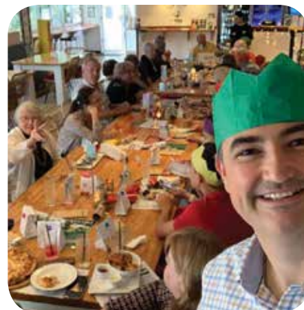
Christmas Lunch at RQs Tavern, Robina