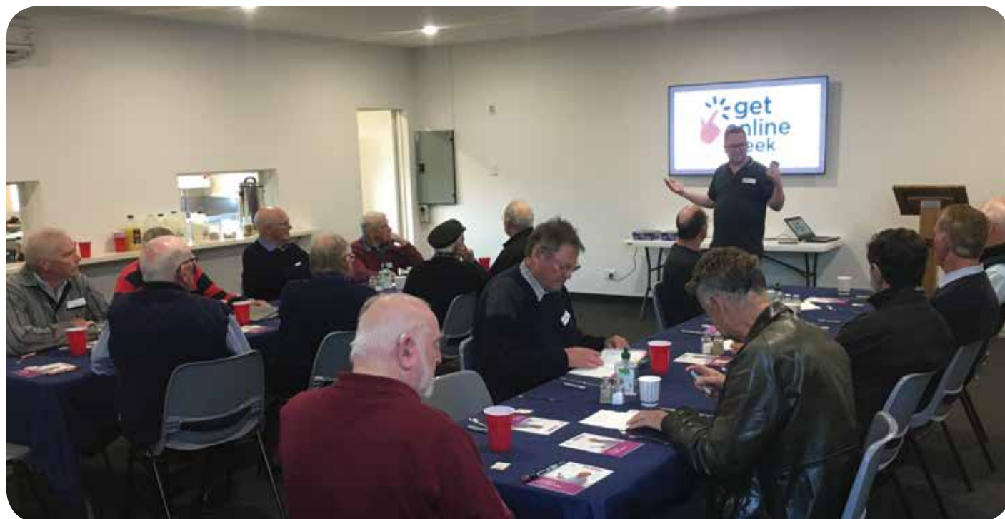
Breakfast Session in Sorell