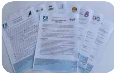
A selection of Frequently Asked Questions

In technical terms NHW facilitates the means by which people feel more connected and involved in their local community, thereby ensuring that suspicious behaviour can be