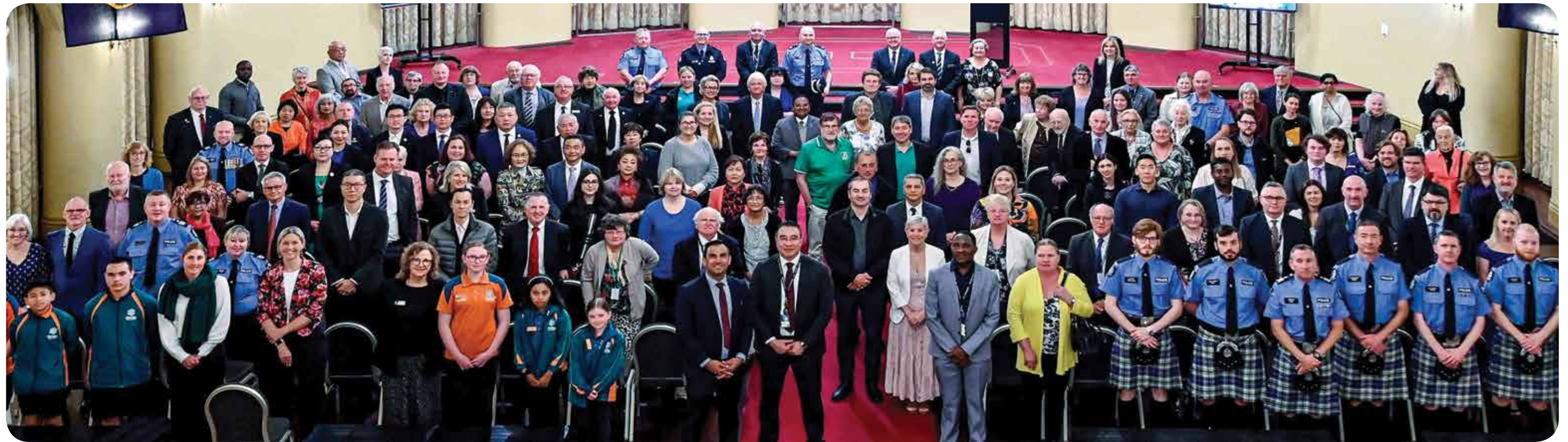
Attendees celebrating NHW WA 40th Anniversary in the Perth Government House Ballroom