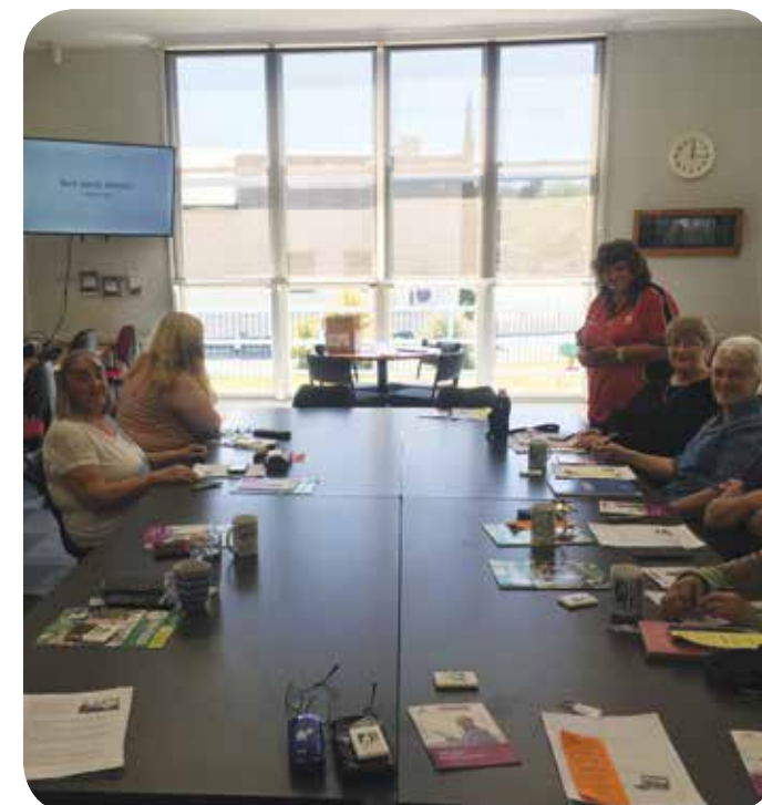
Learning in Lilydale

something that they could share with others present. As simple as this may seem, the realisation that you do know something technical that can help someone else builds self-esteem and confidence to learn more.