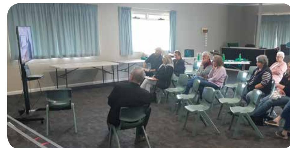
Blackstone Heights is engaged