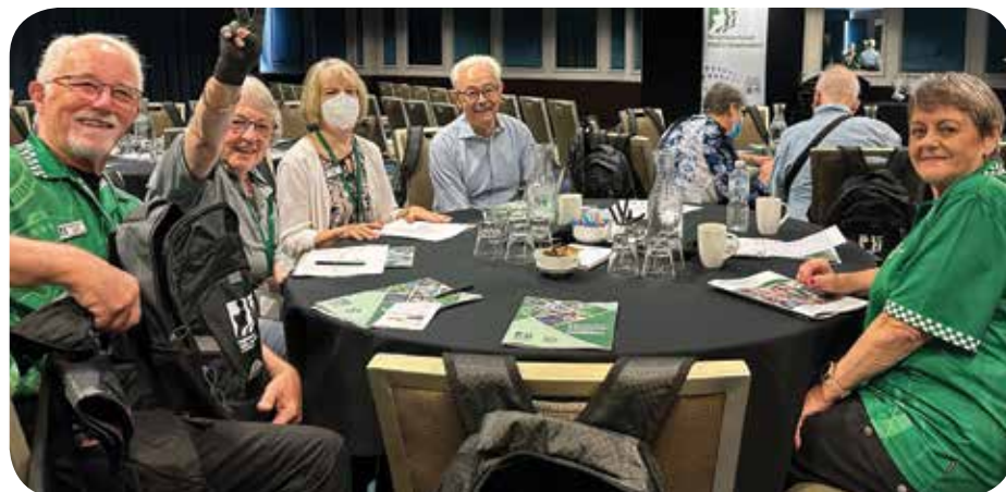
Volunteers at the NHWQ State Conference, Brisbane