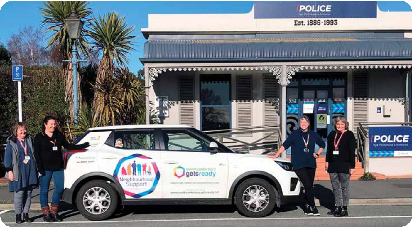
NSNZ were thrilled with their new wheels, which meant being able to travel and connect to more members of their community

Here's an overview of the latest news and highlights from the team at Neighbourhood Support New Zealand.