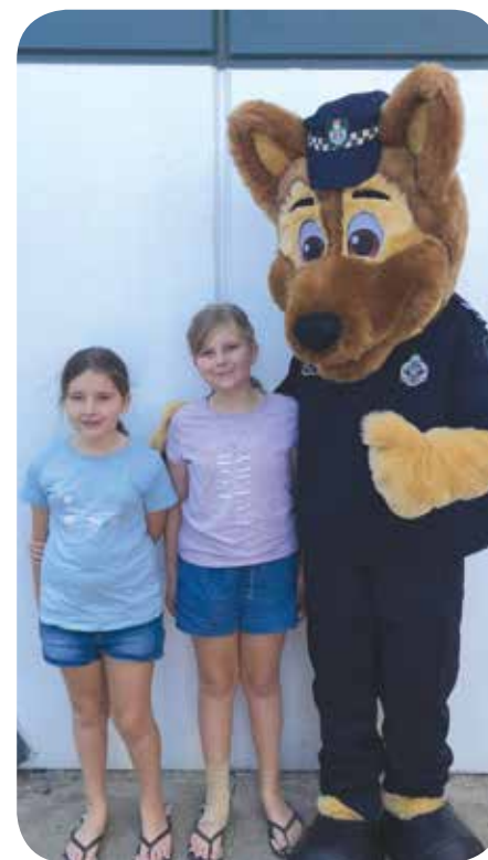
PD Cluedo and some friends