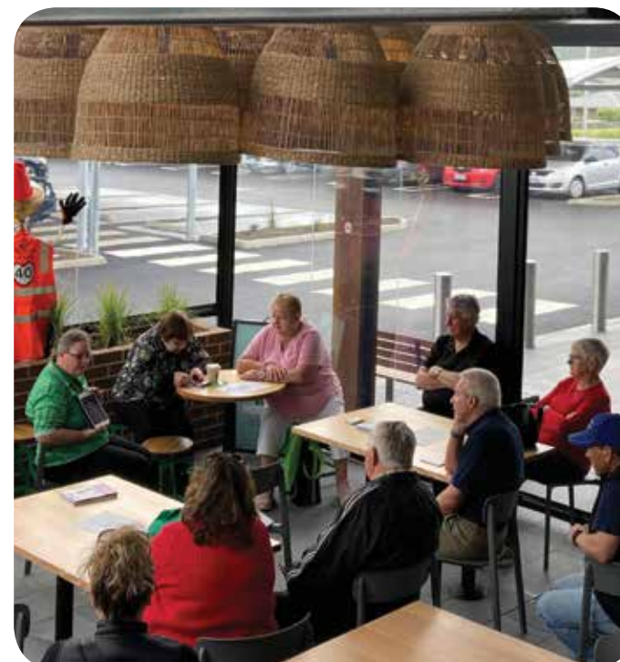
iPad class in Glebe Hill

are incomprehensible to most of us. The fact is, we don't need to understand how it works – we just need a few basic skills to make it do simple tasks for us. And what we found was that at each of the events, many of the attendees knew