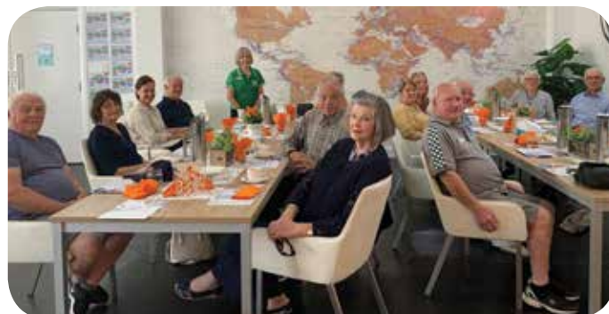
My Aged Care Workshop, Ashmore