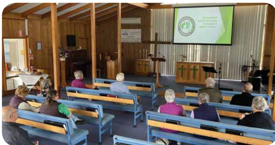
COVID Safe in Howrah!

The importance of this campaign in reducing anxiety about being online cannot be understated. However, it was the Tasmanian experience that