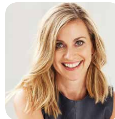
eSafety Commissioner Julie Inman Grant

Be Connected provides a wide range of self-paced courses to help improve online safety and security settings, accompanied by easy-to-follow instructions with short videos and summary sheets to download and use as helpful reference tools.