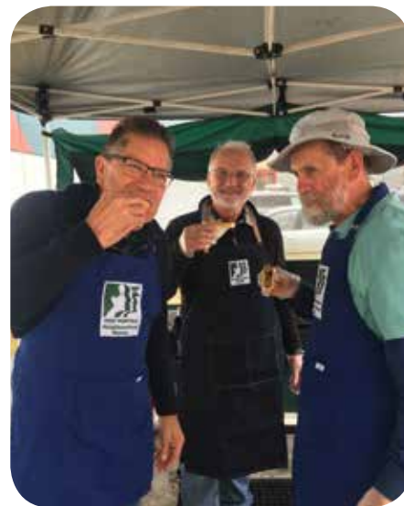
Our volunteers at Mornington eating the profits from the Bunnings Barbecue!