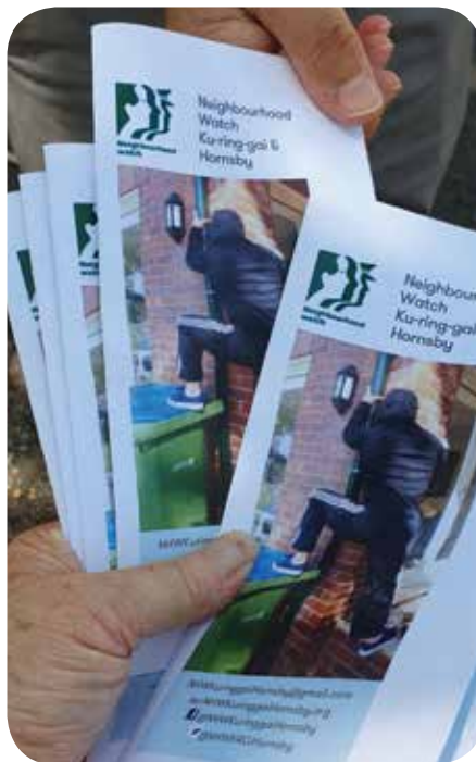
Have a brochure

reported to police quickly. Police can either prevent criminal behaviour or apprehend the criminals in the act, or shortly thereafter. Residents are further educated in crime prevention and empowered to take responsibility for protecting themselves, including protection from the growing online crimes, such as fraud, scams and identity theft.