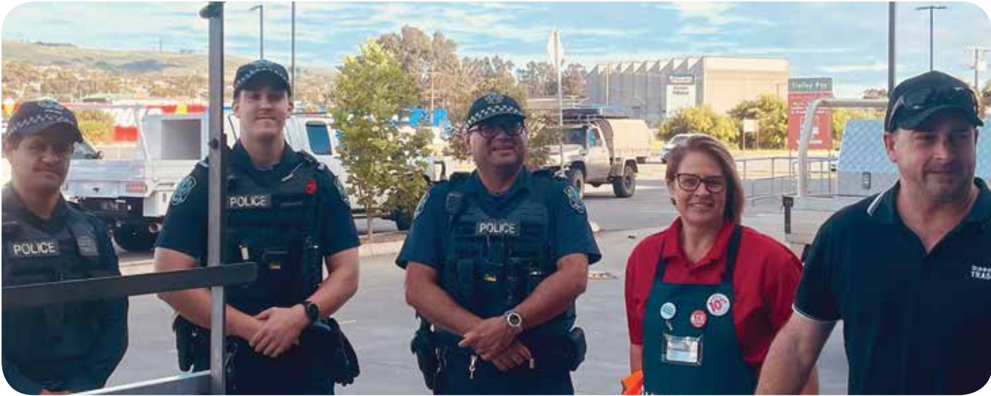
Police officers from Eyre Western LSA (Port Lincoln) and staff from Port Lincoln Bunnings hosted a 'Breakfast for Tradies' during NHW Week and Crime Prevention Week

approximately 80 people on rural crime and rural security. Crime trends relating to diesel, stock and tool thefts were discussed as well as highlighting the importance of reporting rural crime to police. The usefulness of having a CCTV system which provides high quality images was discussed and how such material can support the identification and prosecution of offenders. Members from the Limestone Coast Crime Prevention Section spoke to farmers on the importance of securing their vehicles and homes when unattended, and community members were encouraged to utilise the NHW stickers not only on their council bins but also on their water/feed tanks and sheds as a crime deterrent.