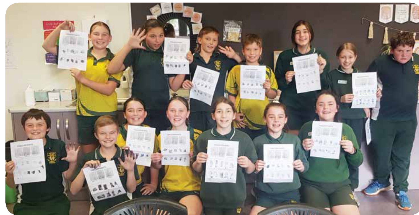
Our Lady's Primary School Forensic Science day was a lot of fun and a big hit with the students

Apart from being a Life Member of NHW Tasmania, he is listed as being a Life Member of another seven volunteer organisations. What an outstanding life of service. The Neighbourhood Watch movement across Australasia salutes a very deserving recipient.