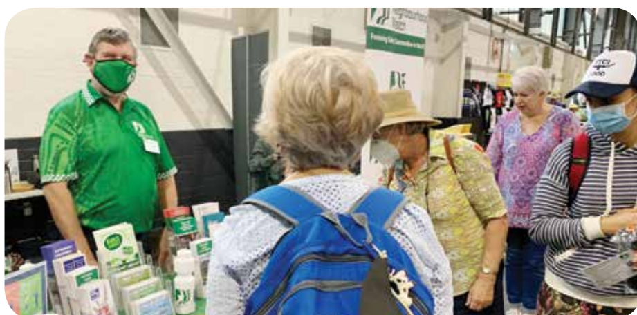
The NHW stand soon attracted visitors on the opening day of the 2022 Royal Canberra Show

In addition to the numerous informational publications from NHW, there were also brochures from AFP and Crime Stoppers.