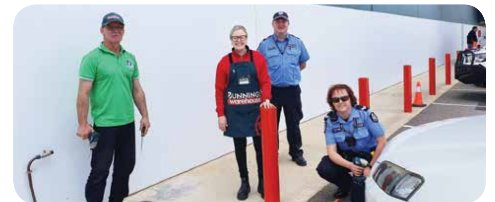
NHW, Police and Bunnings staff attaching anti-theft number plate screws during NHW Week