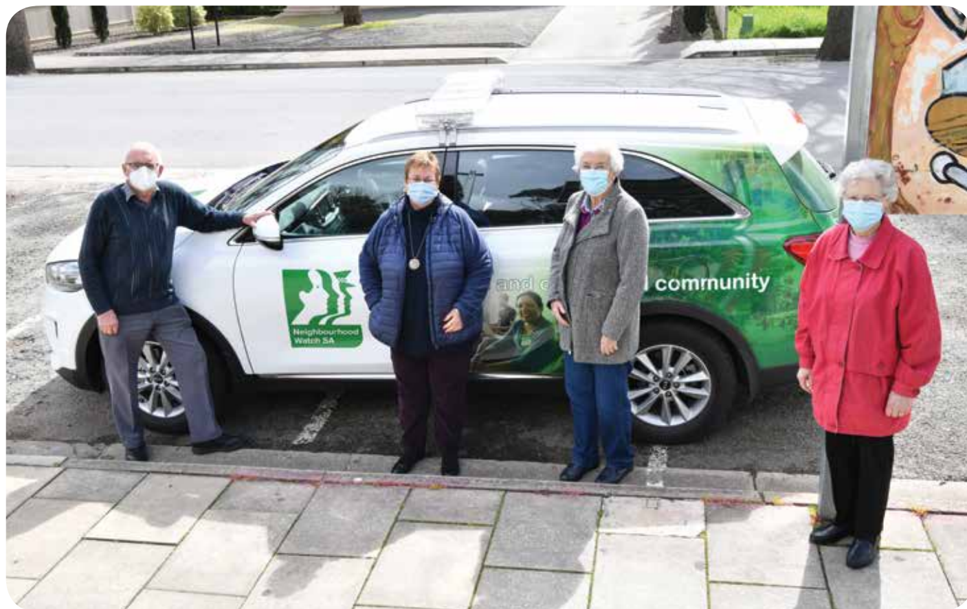
Members of Clare NHW group gearing up to get spraying