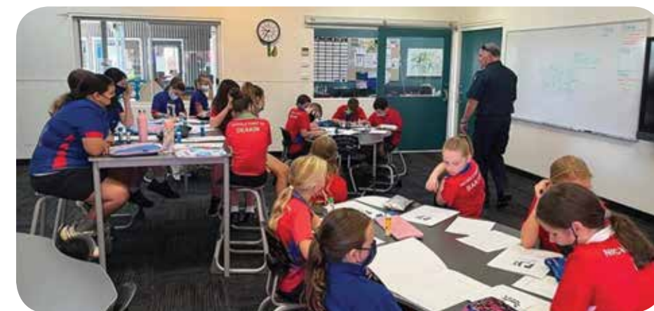
Students at Nicholls Point Primary learn how to keep their home safe

In term 2 it was all about Home Security and Forensic Science. The first session centred around how to minimise the risk of becoming a victim of crime, and the preservation of the crime scene if it did happen. Session 2 was a natural progression into some