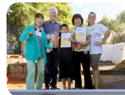
Neighbourhood Support North Shore Neighbours Day Street BBQ