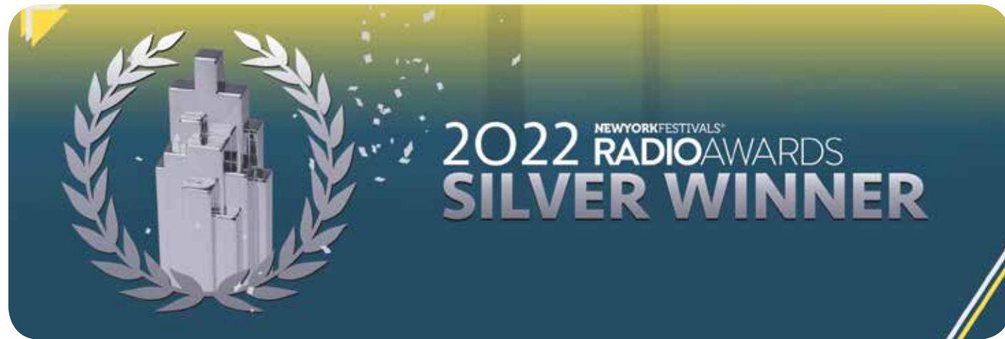
The ACCCE 'Closing the Net' podcast wins Silver at New York Radio Awards