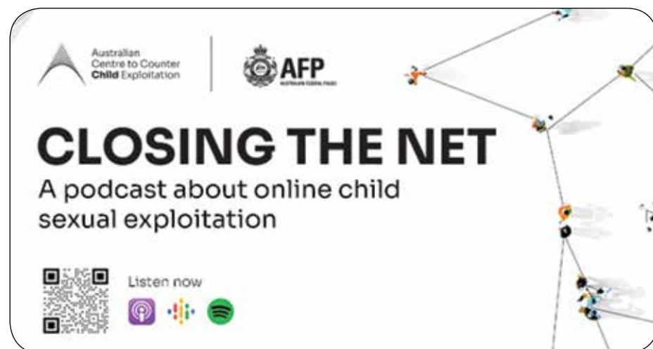
The ACCCE 'Closing The Net' podcast is available on all popular podcast streaming platforms

'Closing The Net' is a podcast series that for the very first time takes you inside the world of the AFP and those policing the 'borderless crime' of online child sexual exploitation.