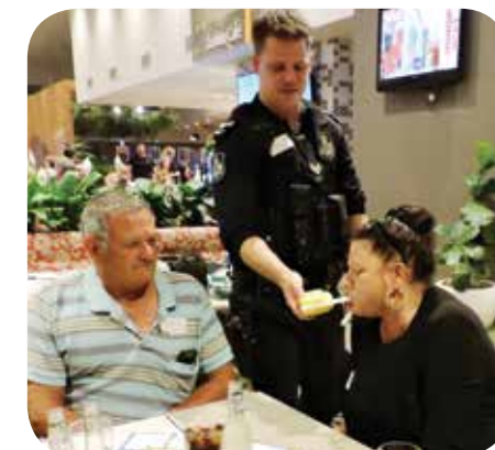
Drink Rite participants having their BAC tested

Two QPS officers assisted with the interactive slideshow presentation, and then carried out periodic breathalyser testing as participants had the opportunity to drink their alcoholic beverage of choice and eat some snacks provided gratis by the licenced club.