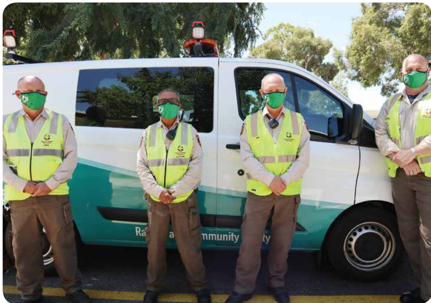
City of Canning Ranger and Community Safety Services team promoting the masks