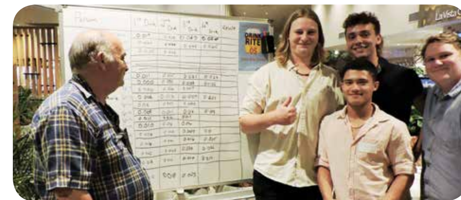
Participants reviewing the results of their tests on the whiteboard