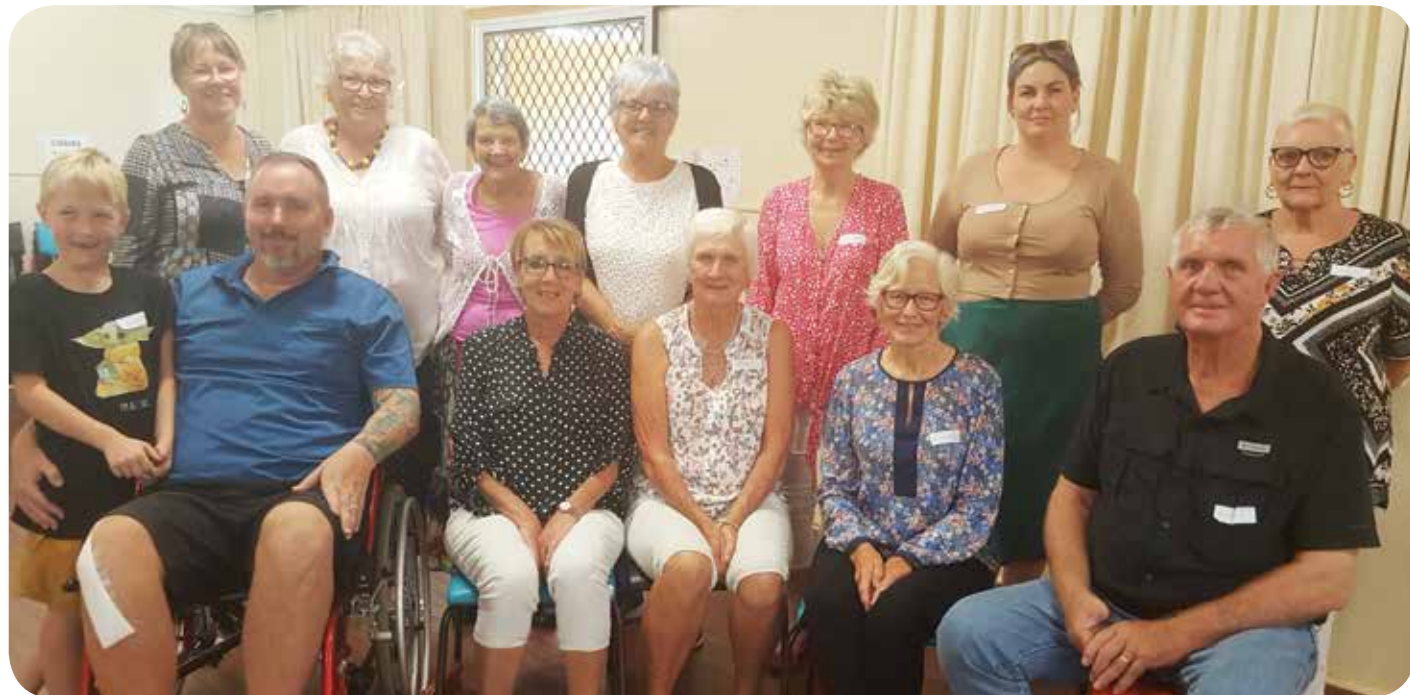
Several of the locals who enjoyed the Neighbour Day morning tea

In keeping with the concept of Neighbour Day as outlined in a recent NHWA Journal, the treasurer of Kumbia NHW organised a morning tea get together at the local hall on Neighbour Day, Sunday 27 March 2022.