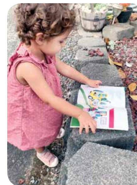
Tamariki enjoy Manaaki Street at the Neighbourhood Support Whangārei street meeting

They were also enjoyed at Neighbourhood Support street meetings and Neighbours Day street BBQs.