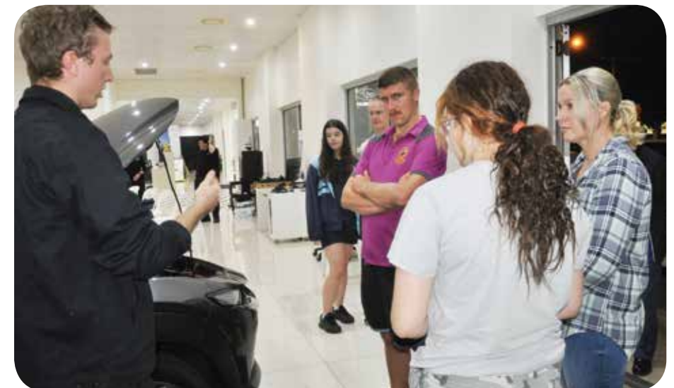
"Now, where do we check the oil level?" Participants listening eagerly