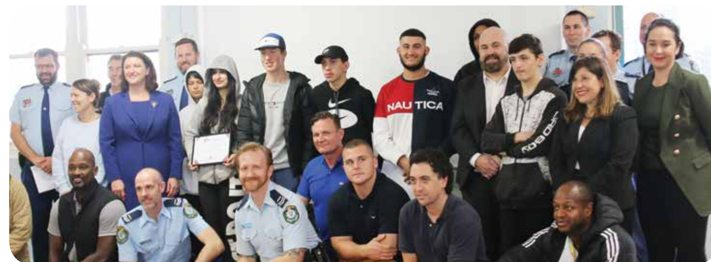
Police officers and staff with participants of the Fit for Change Program