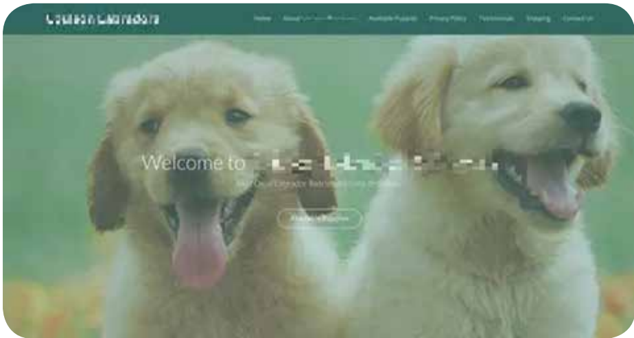
Screenshot of a website created by scammer that has since been taken down