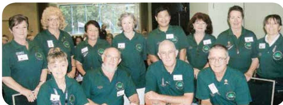
Edmonton NHW assists with a team of volunteers at the 2012 NHW State Conference in Cairns

access to email so we ensure that the information is still available to them.