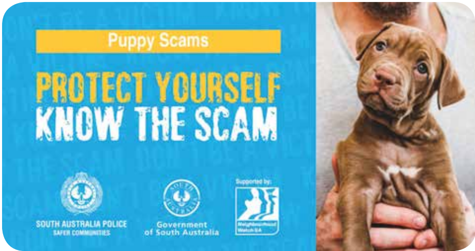
Protect yourself! Know the Scam