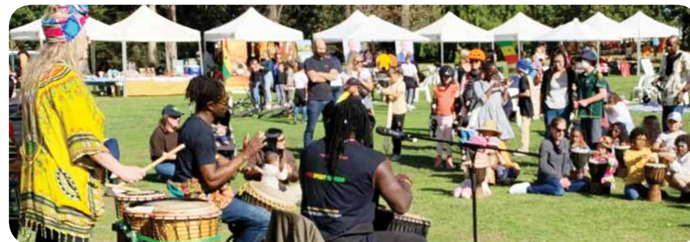
A drumming session at African Party in the Park