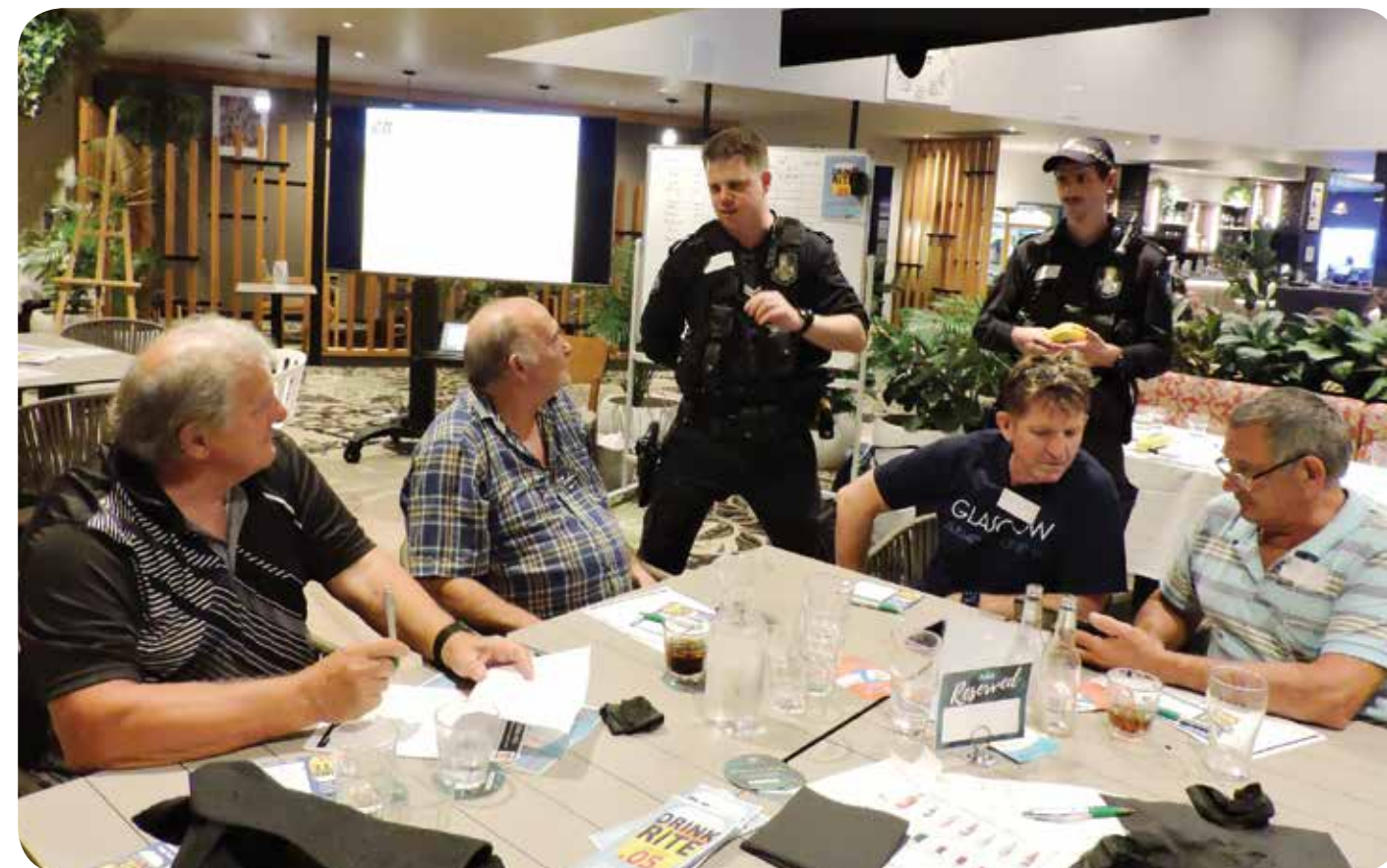
Drink Rite participants listening to QPS officers at the presentation

Health and the Domestic Violence Action Centre Ipswich. The theme for International Women's Day celebrations this year was #breakthebias and discussions were lively, and the community left more informed and empowered with goody bags in hand.