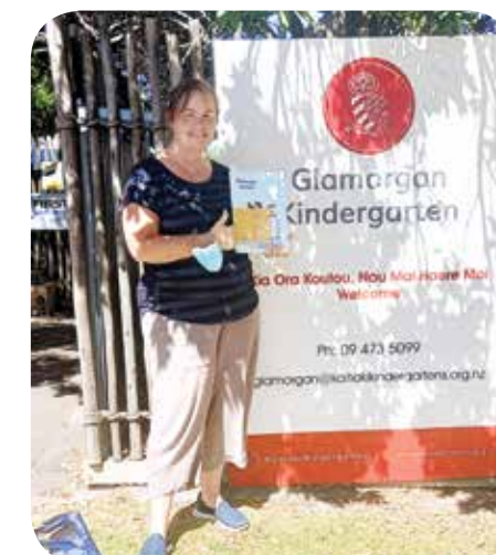
Manaaki Street book delivery to Glamorgan Kindergarten on the North Shore of Auckland