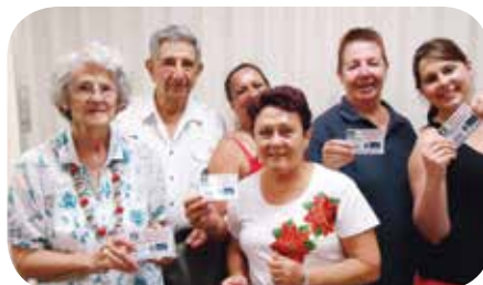
Edmonton NHW Volunteers with their new fridge magnets produced following a successful funding grant

"The introduction of Facebook has been great for our group however we still have many members that don't use social media or have