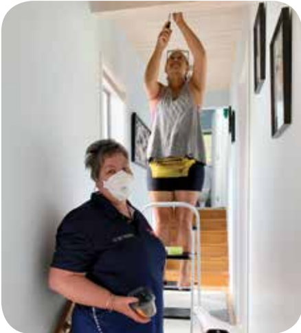
Smoke alarms are installed during the Ahipara Home Fire Safety Day

In the past six months, the number of registered Neighbourhood Support Groups in New Zealand has jumped by 10.5 percent in urban areas, and 22 percent rurally. There are now 18,000 neighbourhood groups registered.