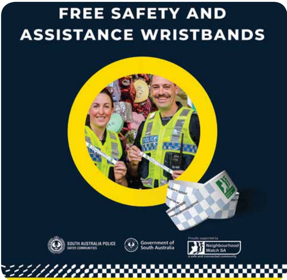
Free Safety and Assistance Wristbands