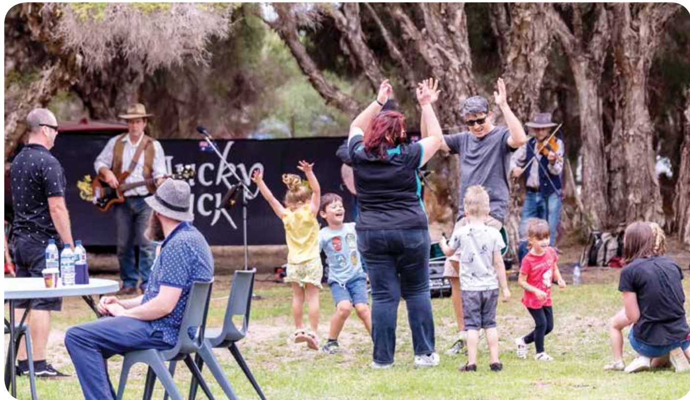
Families celebrate at the Neighbour Day event