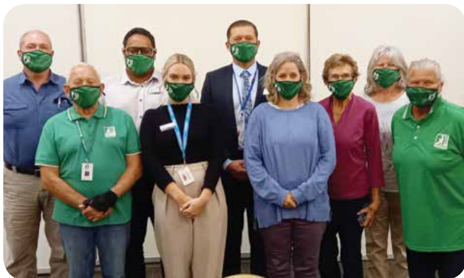
City of Canning NHW group wearing their new masks at their April meeting

We loved having all of the community members come in to see us and leave with a snazzy new mask!