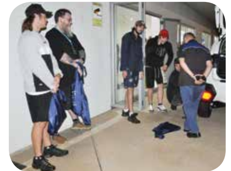
Taking turns to remove and refit a wheel