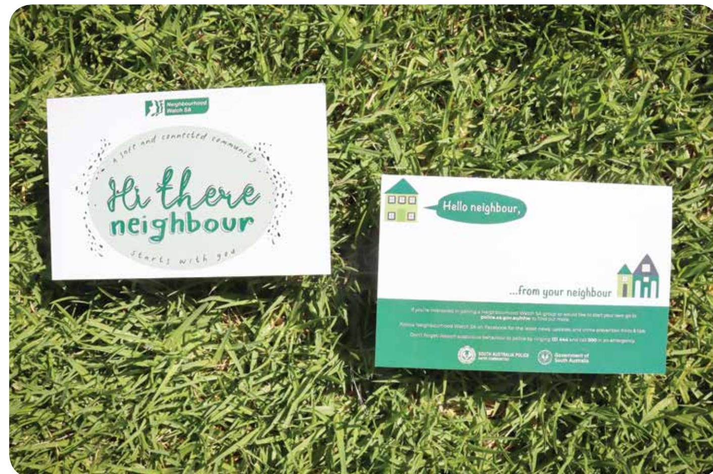
The new NHW SA 'Hello Neighbour' Calling Cards