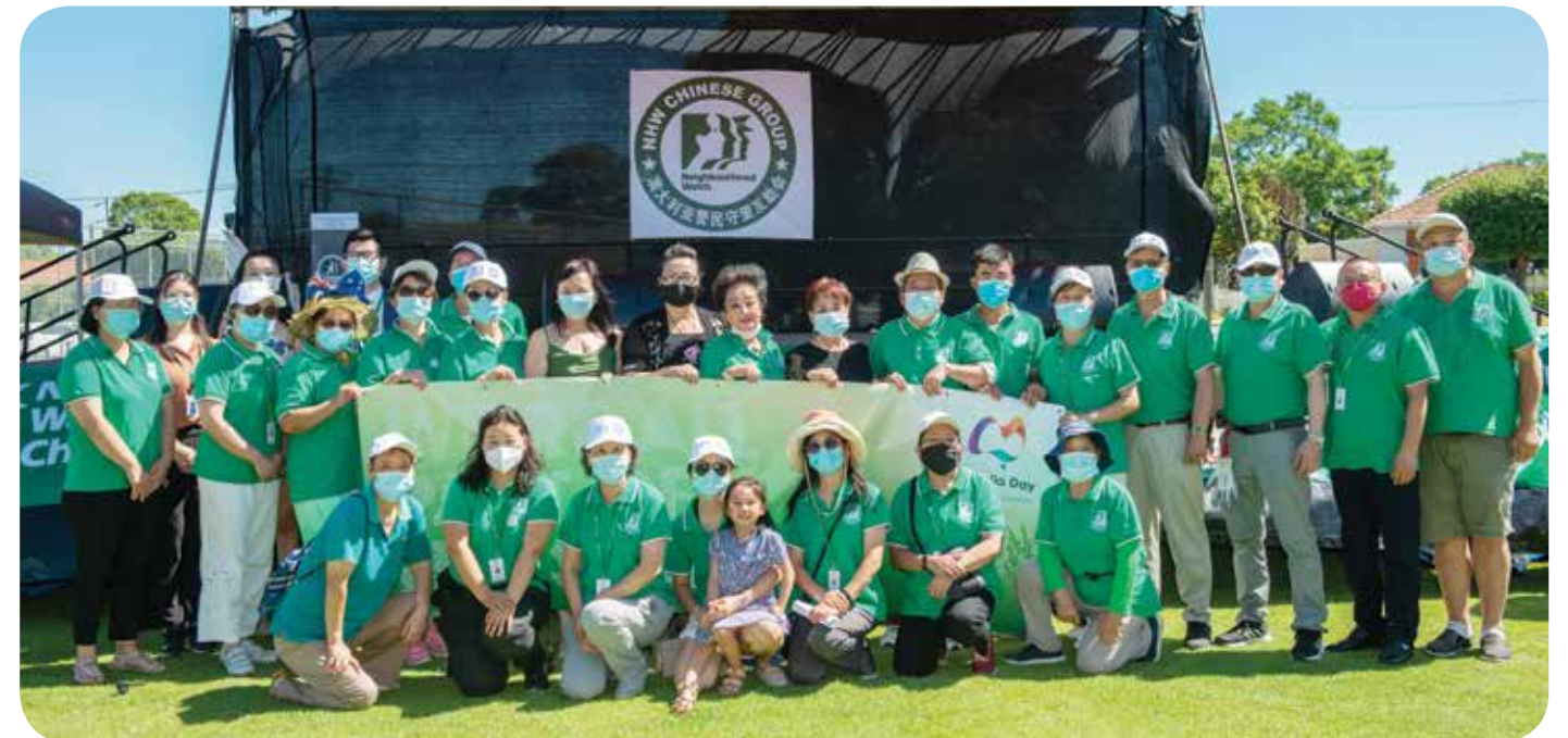
NHWCG dedicated volunteers

There were also many wonderful traditional Chinese cultural performances, such as beautiful folk dances, the amazing Chinese face-transformation, dance performance by Chinese children, classical and elegant harp performance, and more.