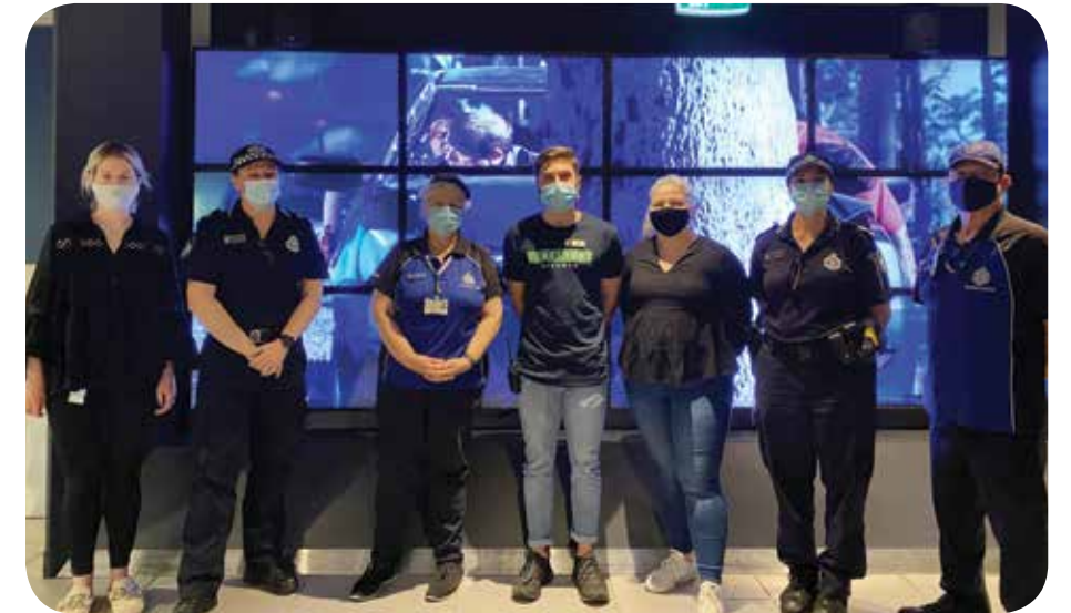
Release of the Road Safety Cinema Ad at Limelight Cinemas. Thankyou to Ipswich City Council, PCYC, Limelight and our Volunteers in Police

Local police attended cinemas in the lead up to and during the September-October school holidays along with project partners Department of Transport and Main roads, Ipswich City Council and