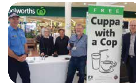
Blackstone Heights NHW delivering at Prospect; and Evandale Watch at the Ingleside Café

With the support of and for Tasmania Police, NHWT has really made CWACs their flagship event. With help from sponsors, a grant from the Clarence City Council and generous businesses we were able to deliver 11 CWACs in 2021 – with every one being a resounding success.