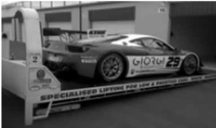
Zero Degree Tray