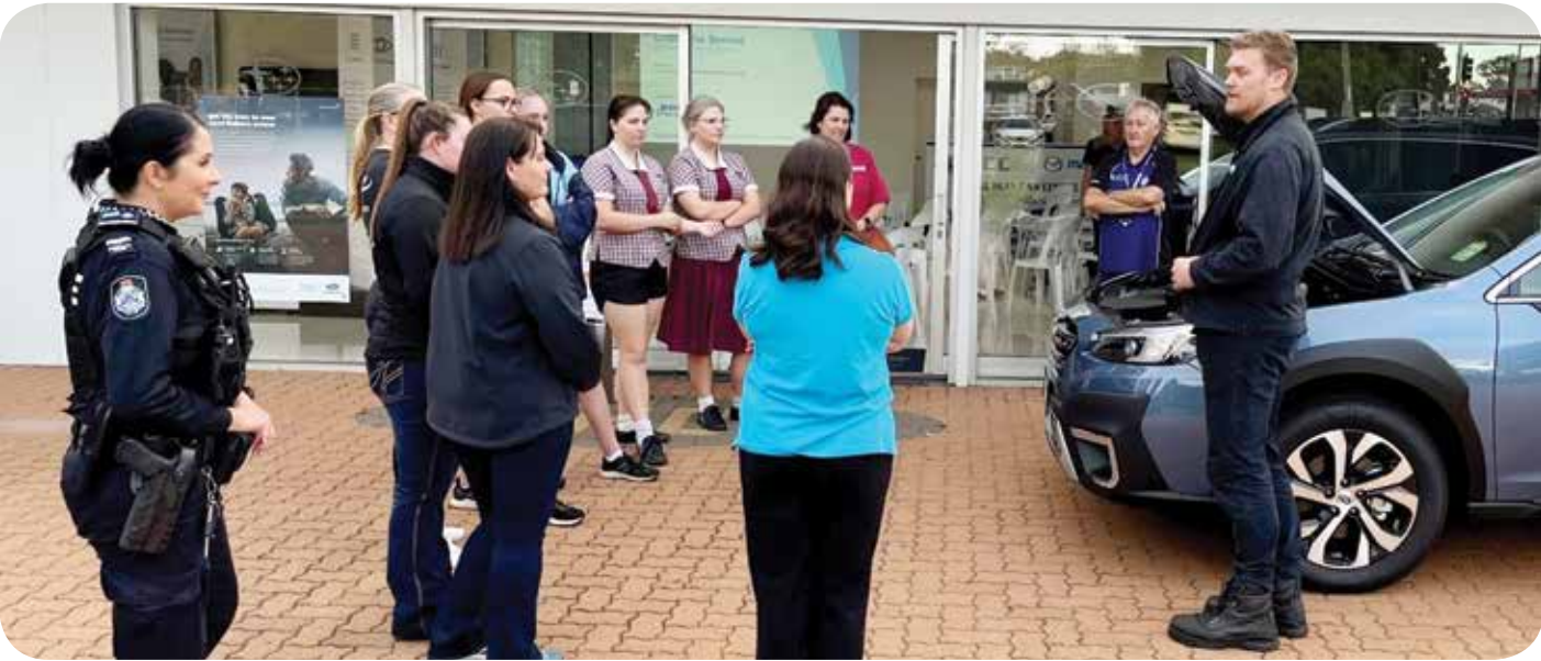
Where is what under the bonnet?

Once again the Under the Bonnet event attracted a full-house of people, young and old to this workshop.