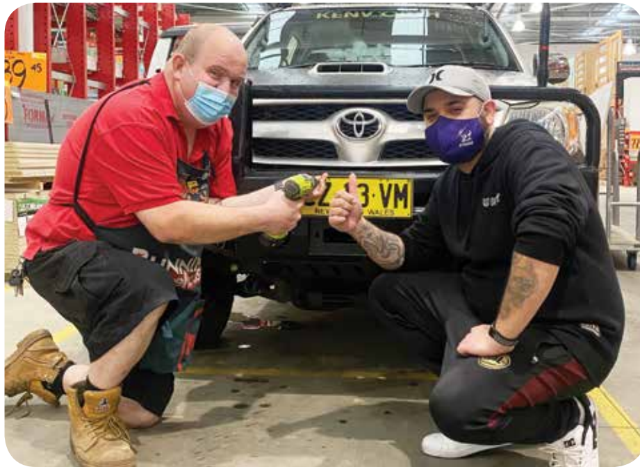
Bunnings staff attached anti-theft screws on over 60 vehicle number plates

Even though it rained the whole day, the day was still a success, with Crime Prevention initiatives conducted in the store and in the drive through area.