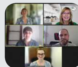
NHWA meeting with members of White Ribbon Australia

This year NHWA had the opportunity to meet with representatives from White Ribbon, who outlined some of their current and upcoming initiatives. Both entities are deeply committed to ending violence against women and children and share the common goal of making our communities safer.