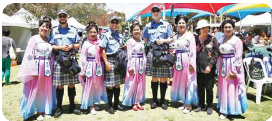
WA Police Pipe Band with dance performers

All formal presentations on the day were designed to assist in breaking down language barriers to help reduce crime and increase community cohesion. The aim of these events is to foster safer local communities, not only for people from Chinese backgrounds, but the entire community.