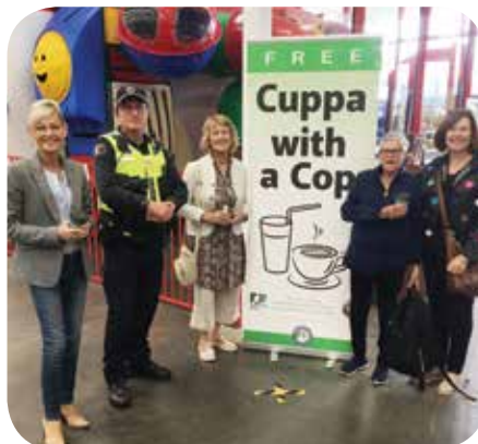
Minister for Justice drops in at Glenorchy