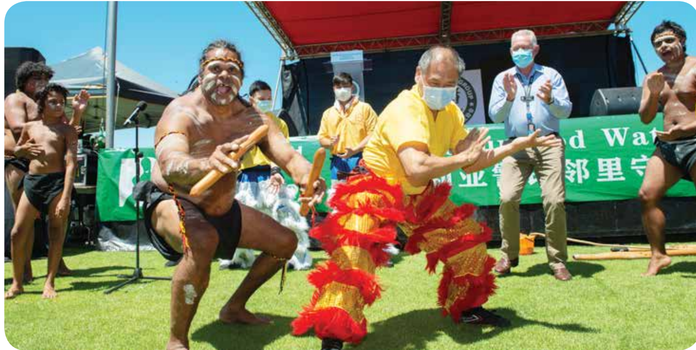
Aboriginal performer and Chinese Lion Dance Master happily dance together