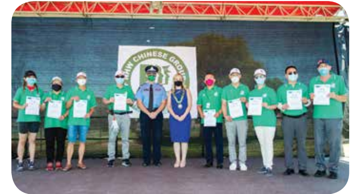
Awarding of certificates to some of the outstanding volunteers