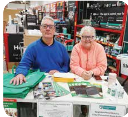
Raffle at Devonport