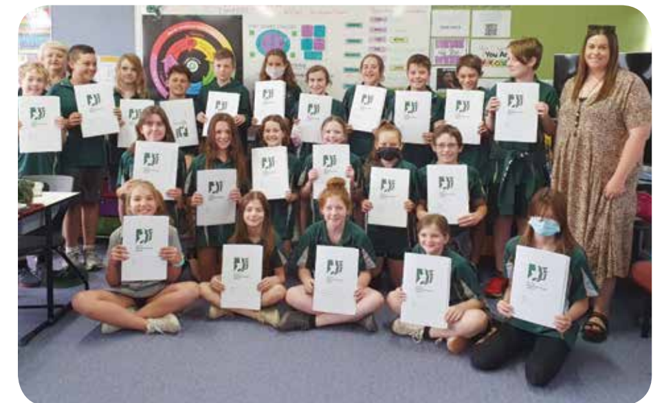
Irymple South Primary Students show off their new Junior NHW folders

It is fantastic that even after a COVID affected year in 2021, the program continues to have such strong support and we are very much looking forward to running the Junior NHW program during what looks like a very busy 2022.