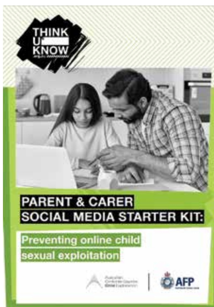
Parent and carer social media starter kit: preventing online child sexual exploitation

Although at the age of 13 a young person is legally allowed to create an account in their own name, it does not necessarily mean that the content and images they will be exposed to is appropriate for that age group.