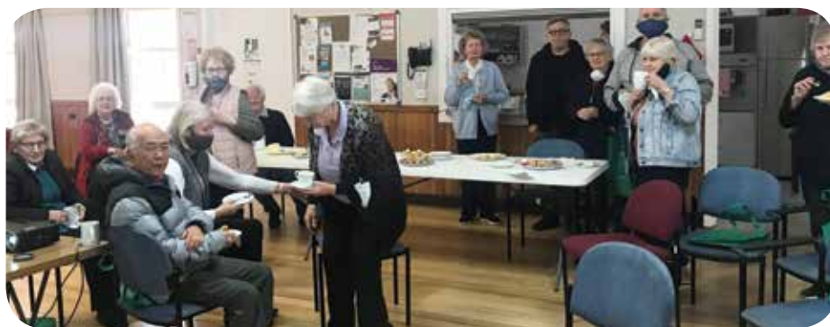
NHW Tasmania members from West Hobart enjoying light refreshments after the Get Online Week event

The grants can be used to provide the venue, facilitator,