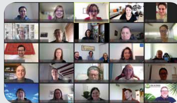
Lead Digital Mentor training day