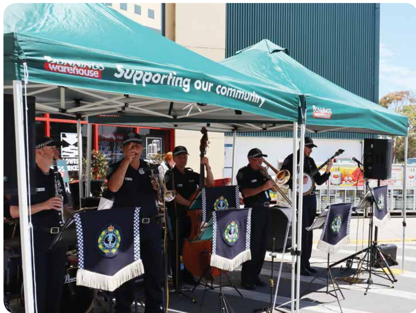
The SA Police Band performing outside Bunnings Mile End during NHW Week 2021