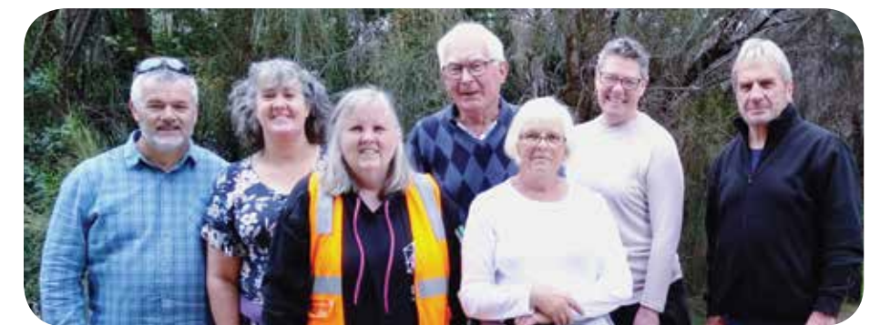
Members of the Old Beach NHW working bee cleaning up their foreshore

Doing something can be infectious because by December the group had formed a working bee to clean up their foreshore - getting a jump start on Clean Up Australia Day. We know that doing something