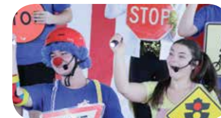
Students of Central Queensland Conservatorium of Music in the Safety Circus production

Approximately 2500 students viewed Safety Circus and the support of organisations such as Neighbourhood Watch and