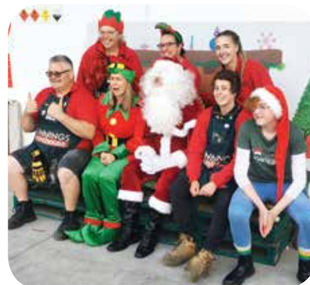
Santa in his element at Mornington