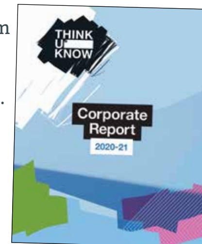
ThinkUKnow Corporate Report 2020-21

Highlights from the ThinkUKnow Corporate Report 2020-21 include: