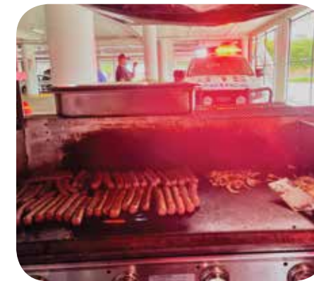
Snags 'n' Sirens – a kids perfect combination!