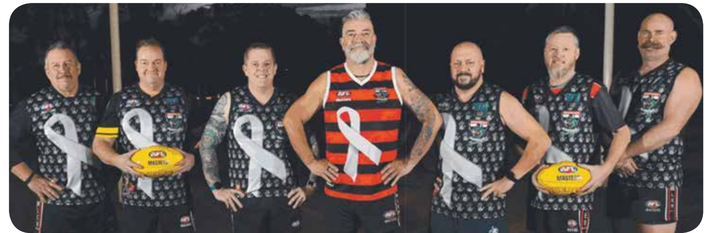
Gawler Bunyips White Ribbon Round - Bunyips stand up against domestic violence