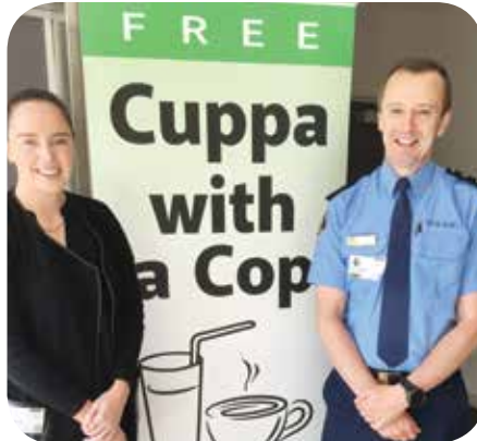
Launch of NHW Week in Hobart

There are seven Bunnings Warehouses in Tasmania and with their help NHWT members delivered four information stands and raffles; three CWACs; one barbecue and three carpark events to round off the Week . We even provided Santa to the delight of children and adults alike.