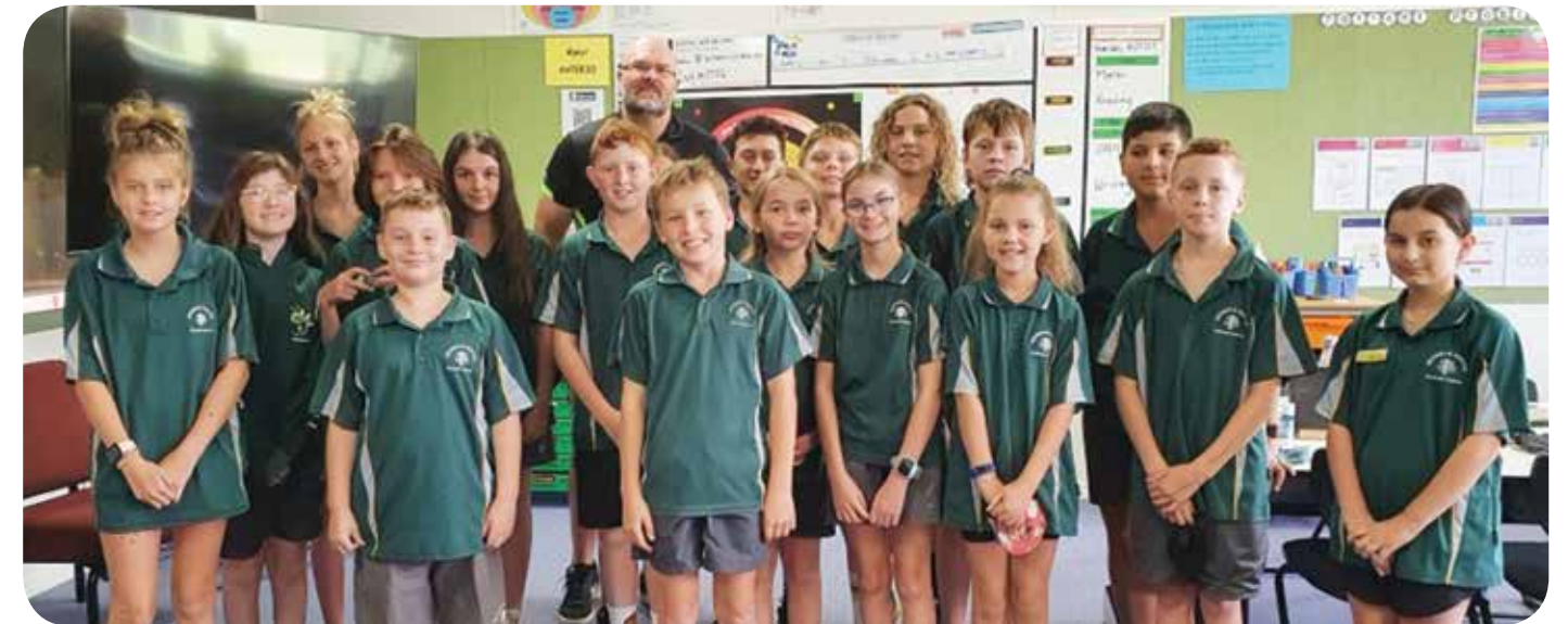
Mildura Junior NHW has started for 2022 with Irymple South Primary being the first school attended for the year