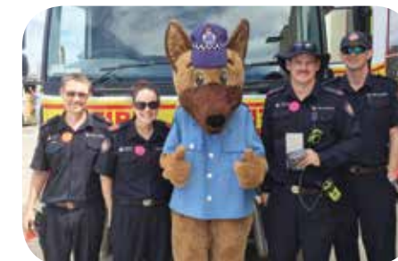
Queensland Fire and Emergency Services hanging out with Cluedo

Through further fundraising efforts Bundaberg Police are currently in the process of ordering their very own Cluedo costume thanks to the wonderful support of Bundaberg and District Neighbourhood Watch. Watch this space for the release of Bundaberg's very own Cluedo, we can't wait!