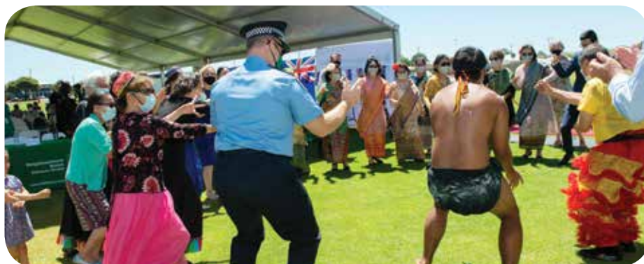
People from different backgrounds, cultures and professions laughed, danced and celebrated Australia Day together