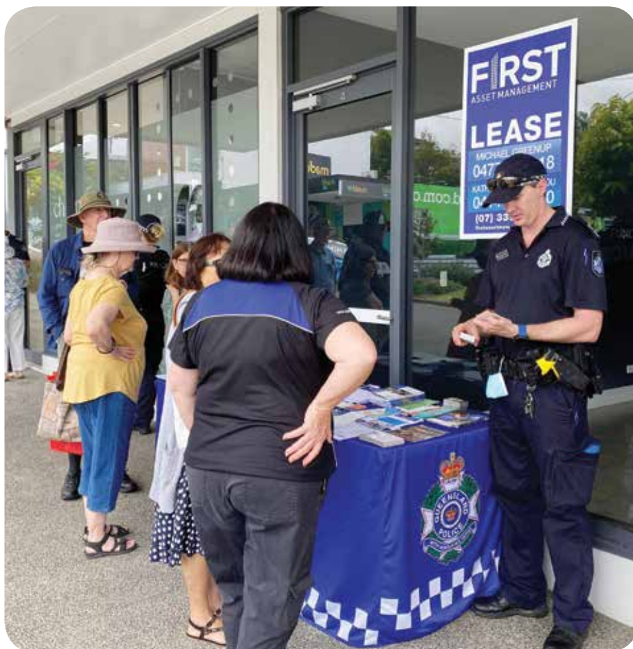
Residents taking advantage of the opportunity to pick up some free guidance about security and safety