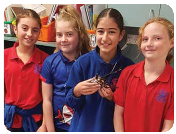
The winners of the bike helmets for eggs competition