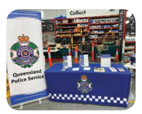
NHW and QPS display table at Bunnings Kingaroy