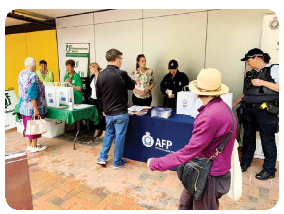
Representatives from NHW, Legal Aid ACT and ACT Policing at the Community Engagement event at Dickson Shopping Centre

While the initial target audience for these sessions was older members of the community (with a focus on elder abuse and scams - two crime trends that are quite significant to this audience) the sessions have attracted people from all sectors and age groups, raising a wide variety of security and safety issues.