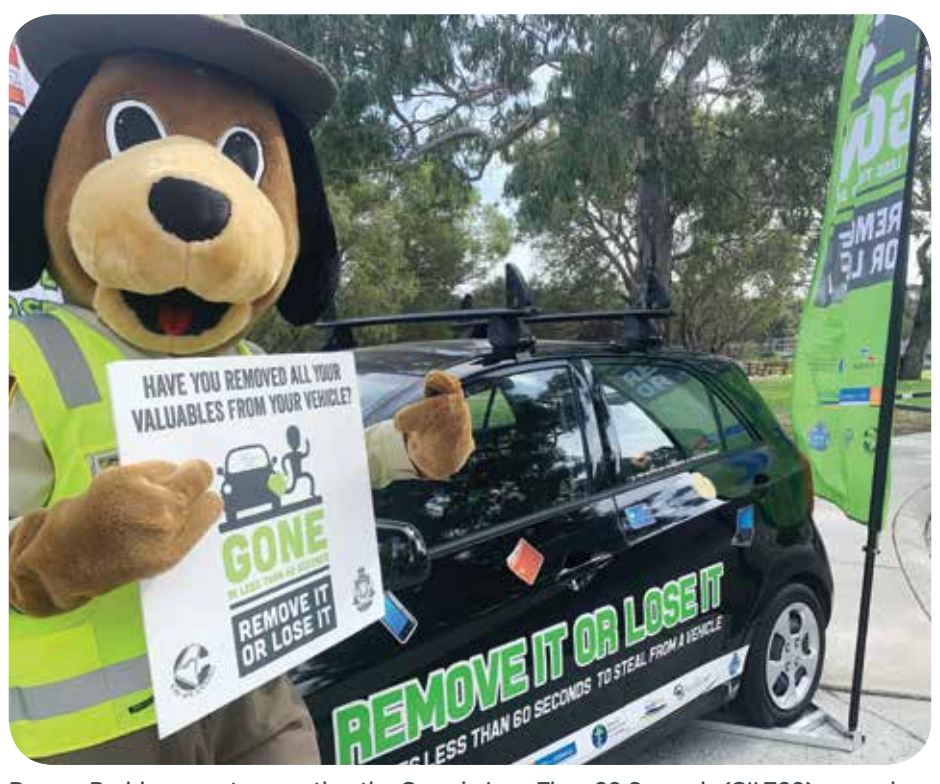
Ranger Buddy mascot promoting the Gone in Less Than 60 Seconds (GILT60) campaign

More recently, the City of Canning attended a local shopping centre with representatives from the Canning NHW, Ranger and community safety officers and Cannington police to raise awareness of theft from motor