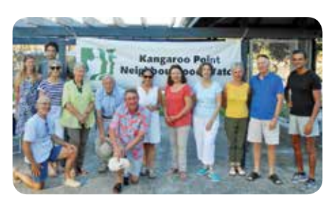
Kangaroo Point NHW members at a national Neighbour Day event in a local park

Formed in 2001 the Kangaroo Point (KP) NHW group celebrated its 20th anniversary at their April meeting, with a lively crowd of