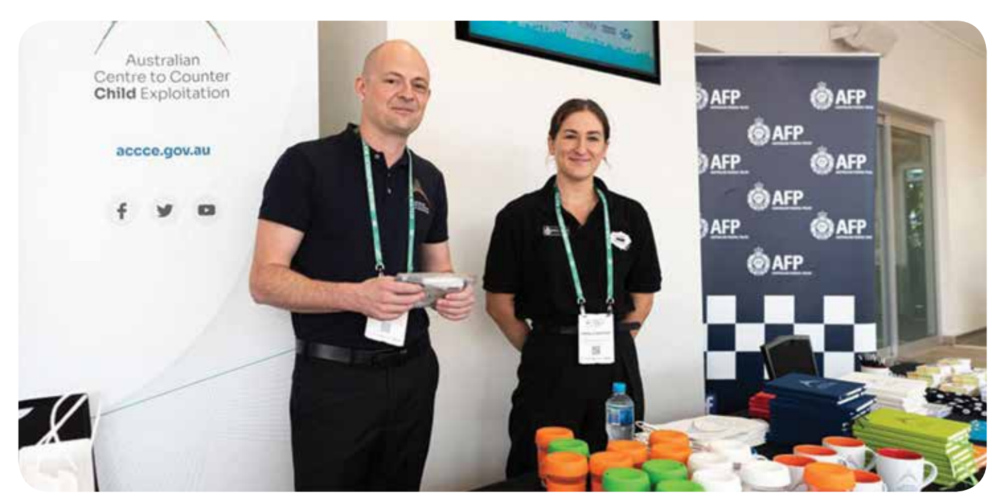
AFP staff engage with delegates at the Neighbourhood Watch International Conference