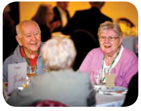
Members of Hope Valley & Highbury celebrating at the dinner

"The group is still getting a lot of engagement and attendance at our monthly meetings which is great to see. I think it helps that we have such a good core group of volunteers; even during the COVID-19 shutdown we were still producing our monthly NHW newsletter.