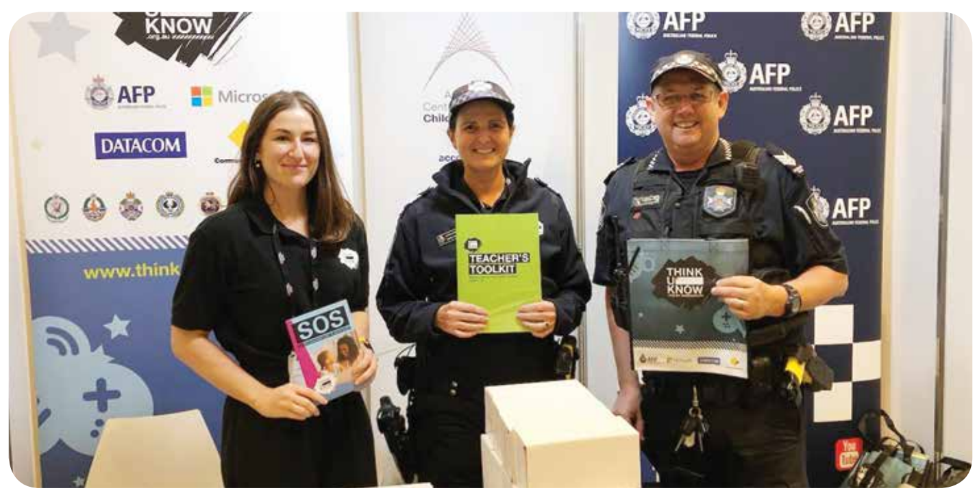
AFP and Queensland Police meeting with educators at the National Education Summit

The AFP and ACCCE attended the National Education Summit from 4-5 June 2021, along with Queensland Police, to speak to educators from across Australasia about the ThinkUKnow program.