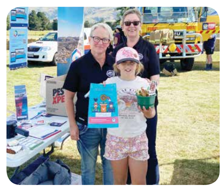
One of the winners of Otago Neighbourhood Support's Neighbours Day Aotearoa colouring competition