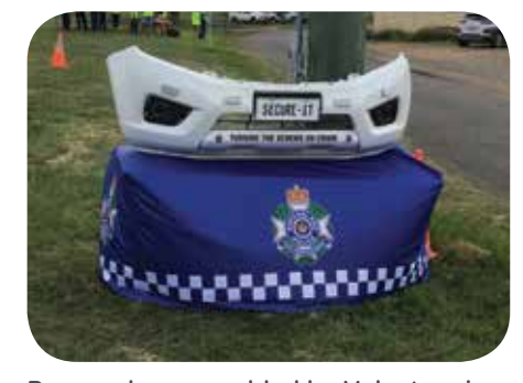
Bumper bar assembled by Volunteer in Policing Peter Verbakel on display at the 'Turning the Screws' event