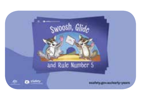
Early years picture book