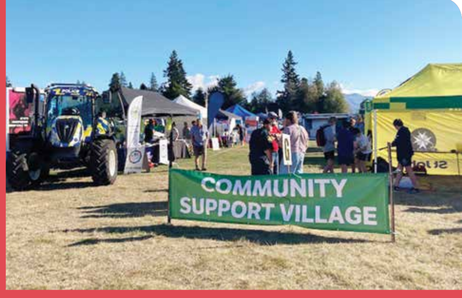
South Canterbury Neighbourhood Support stall in the 'Community Support Village' at their local A&P show this year

The goal of the village was to help raise awareness about safety, health, wellness, preparedness and how to get better connected to your peighbours and these services