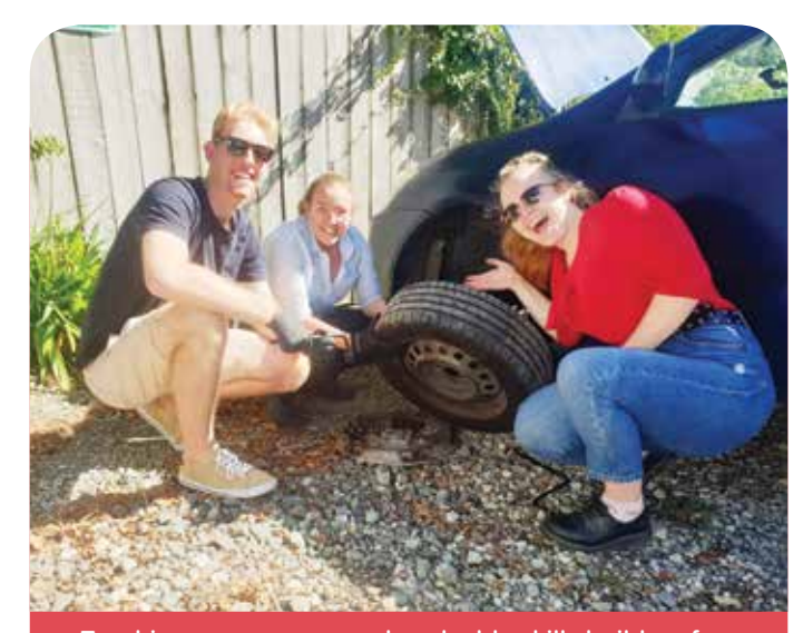
Teaching our young people valuable skills builds safer and more resilient communities