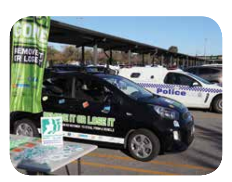
City of Canning promoting NHW and GILT60 at local shopping centres

vehicles. The city promoted the Gone in Less Than 60 Seconds program, which is a joint initiative with seven neighbouring local governments targeting theft from motor vehicles. This awareness-raising initiative encourages people not to leave valuables in their vehicle and to always lock their car.