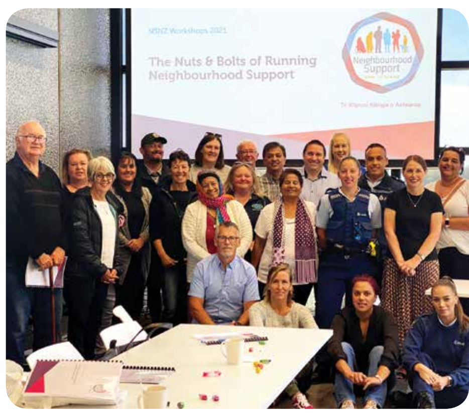
Workshop attendees from Waikato District

These workshops are designed to be interactive and an opportunity for people to come together, share ideas and learn from one another, so that Neighbourhood Support can continue to grow and flourish throughout the country.