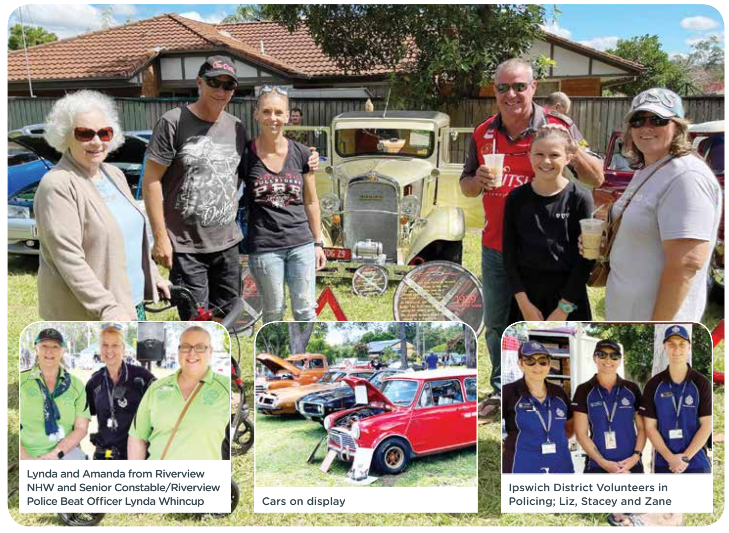
Some of the event attendees