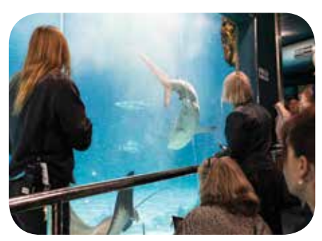
Pre-dinner reception at Sea World's Shark Bay