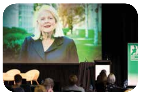
Minister for Home Affairs, the Hon Karen Andrews MP during her pre-recorded welcome address