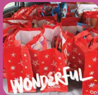
A boot full of Christmas goodies collected by Nerang 8 NHW and donated to Vinnies

This was one of the ways that they were able to give back to the less fortunate in their community. Making Christmas a little more special for everyone.