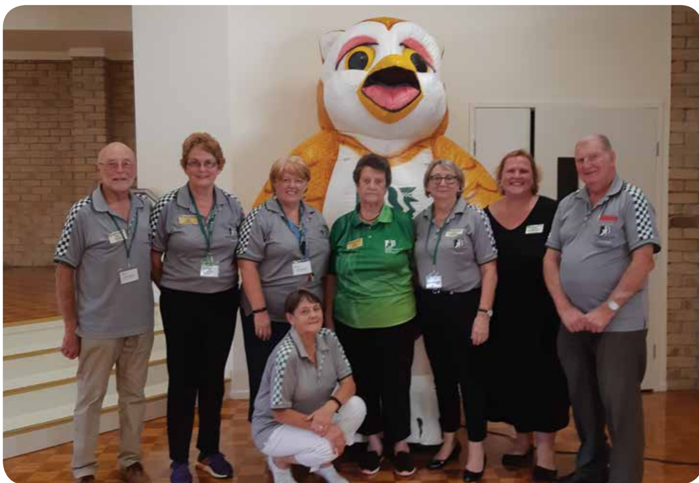
Gold Coast District NHW Committee with Seymour the Owl