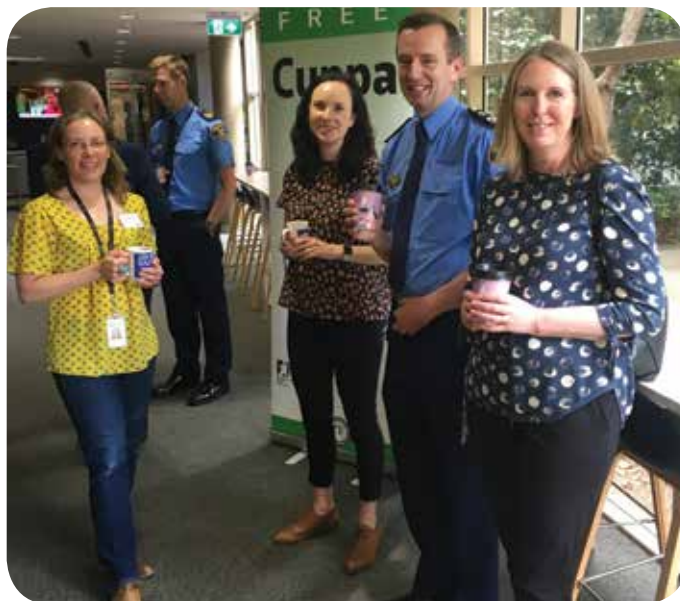
Commissioner Darren Hine and guests enjoying a cuppa and a chat at the launch of Neighbourhood Watch Week in Tasmania