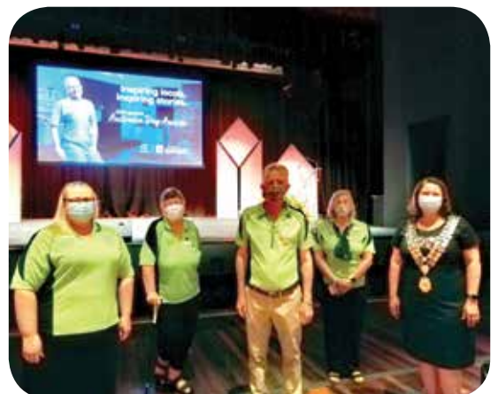
Committee Members with Ipswich Mayor Theresa Harding