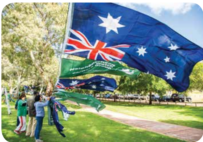
Volunteers hoisting Australia and Neighbourhood Watch Flags