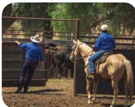
Rural Crime Prevention Team mustering