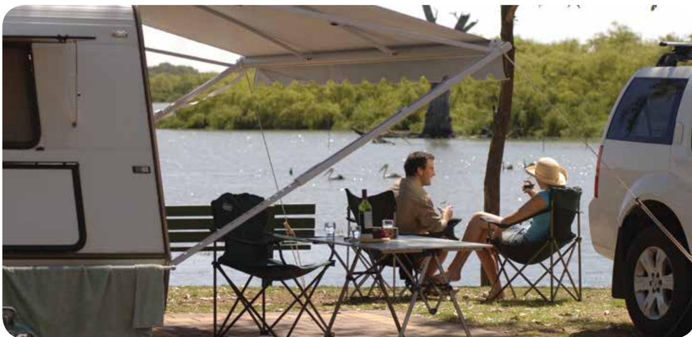
Enjoying the great outdoors