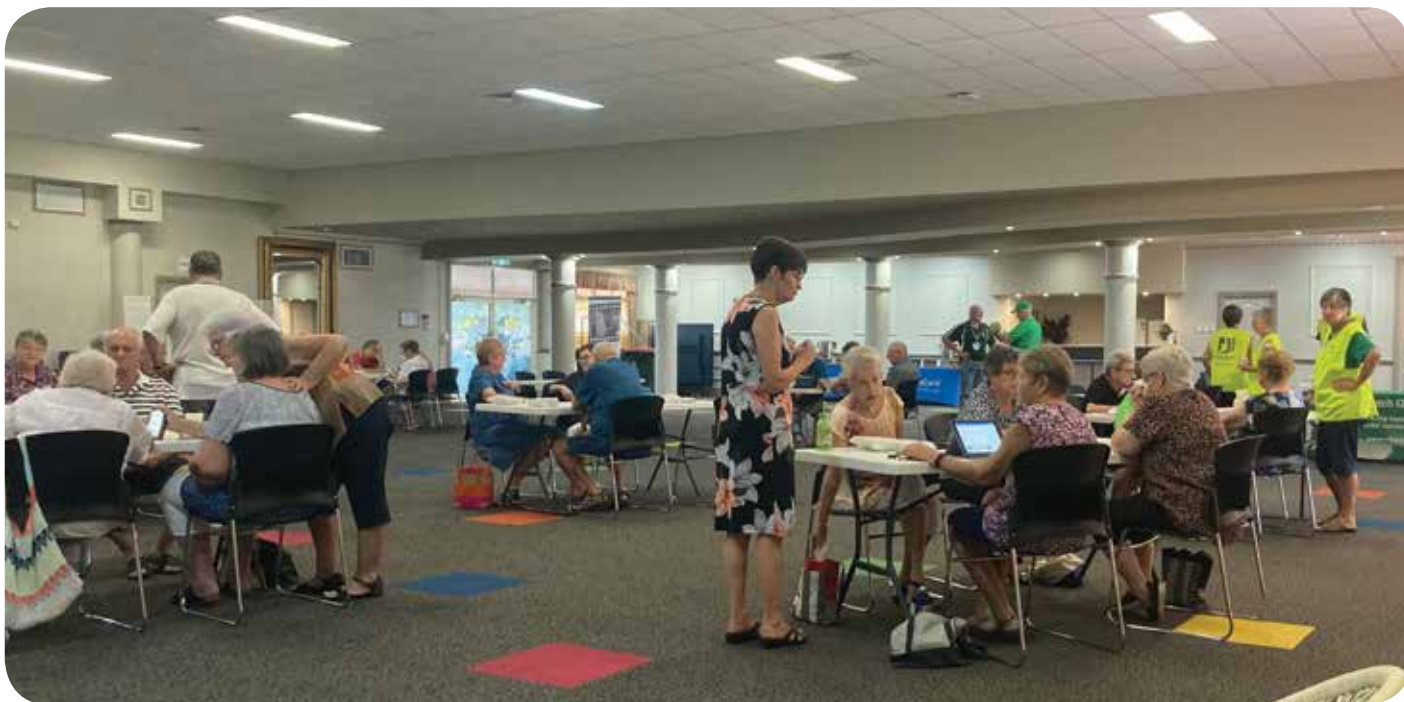
Get Online Week event hosted by Carlyle Gardens Neighbourhood Watch