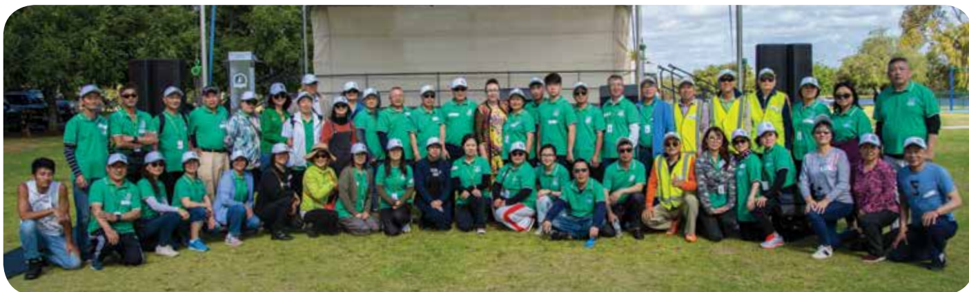
Volunteers of the NHWCG posing for a group picture, we thank each and every one of them for their special contribution to building a safer and closer community