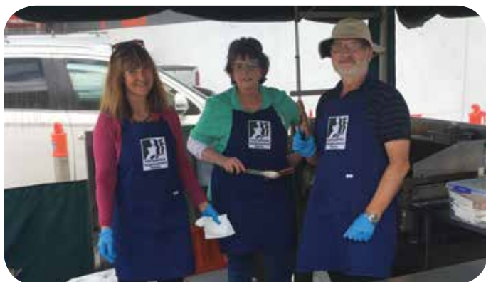
NHWT volunteers at Bunnings during NHW Week