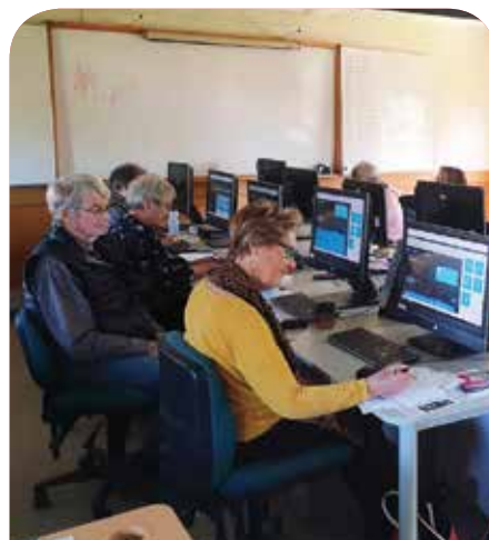
TSNS Street Contact receiving neighbourhood resilience planning training

On 18 November 2020, Masterton Neighbourhood Support hosted their annual WEconnect awards night and international potluck. About 60 people including the Mayor gathered to recognise some of the kind volunteers who make the program possible. The purpose of the program is to pair newly arrived immigrants and refugees with a local buddy. The highlight of the evening was the amazing spread of food representing the diverse cultures and taste buds of attendees, who were asked to bring a dish representing their home country or heritage.