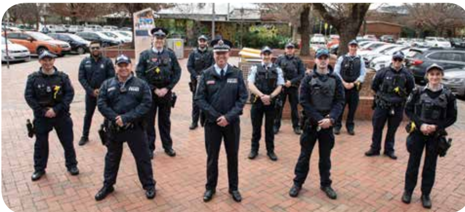
ACT Policing's Proactive Intervention and Diversion team

You might be surprised to learn that in the ACT around 80 percent of incidents that police attend do not result in an offence, but often cause repeat calls for service if they are not resolved properly. On top of this, the Territory has seen a 30% increase in time critical incidents over the last 5 years, and the average time required to deal with incidents has increased due to their complex nature. As a result, there is a strong demand placed on frontline officers.