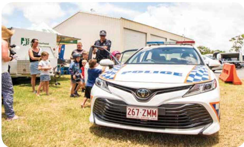
Police vehicle inspection

Congratulations and thank you to all the volunteers who helped; from the men who raked the field of the freshly mown grass, to the organisers of the games,