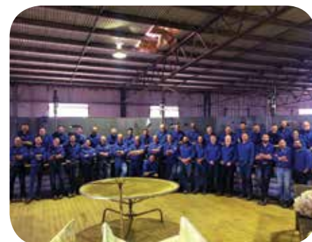
Rural Crime Prevention Team

If your rural community group is holding a meeting and would like to discuss strategies to improve