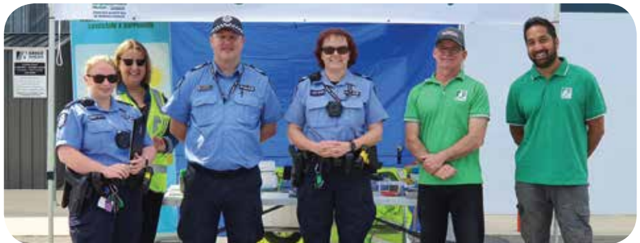
NHW Landsdale volunteers assisting Wanneroo Police with crime prevention initiatives

In December, NHW WA organised a workshop for active groups in relation to volunteering, recruitment and retention. It was a great opportunity to connect with other WA groups, which have diminished with the new framework in WA. A representative from our group has been invited to attend the NHW WA working group meeting, which is another way to connect and share information to assist volunteers in their work to help WA Police in their fight against crime.