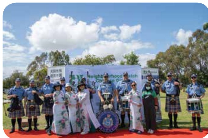
WA Pipe Band and performers of the Chinese traditional umbrella dance

impact of COVID-19 on the mental health of the community through being socially, mentally, and physically active.