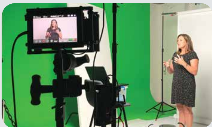
Professor Lorraine Mazerolle during the video training filming

Get ready for the launch of the NHPWA video training series. We are in the process of finalising short training videos for NHW groups. The topics for the training have been identified through a survey of over 800 NHW members. Topics will include: grant writing, leadership, reporting and more.