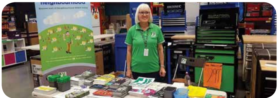
NHW Landsdale volunteers providing information on security measures to their community