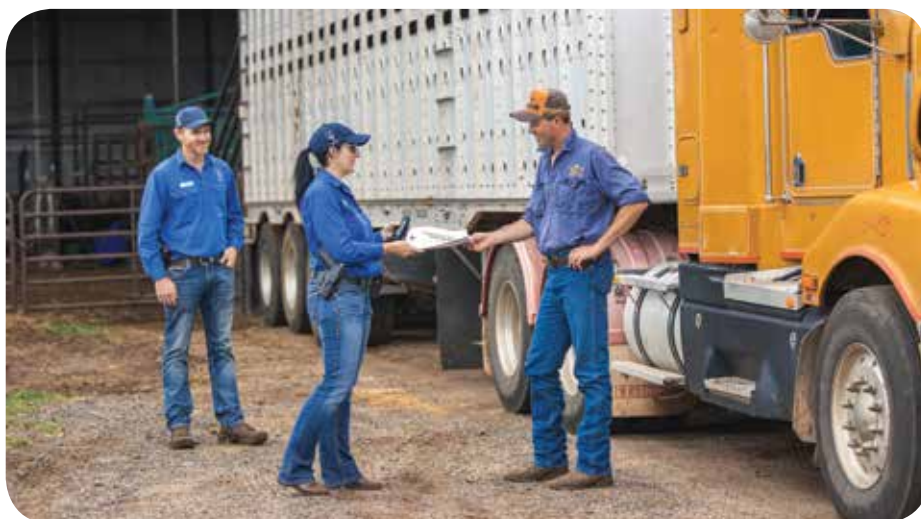
Livestock transport inspection

Rural crime often occurs in remote locations and offenders take advantage of this believing they are targeting an easy victim. We want to work with rural communities and rural industries and come down hard on these offenders and show them our farmers are not easy targets.