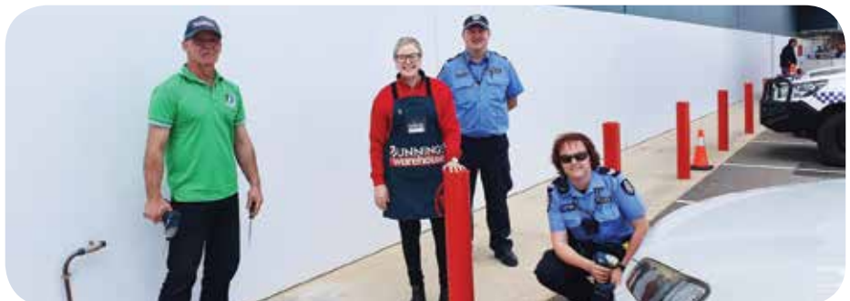
NHW Landsdale partnering with Wanneroo Police & Bunnings Wangara in securing vehicle number plates