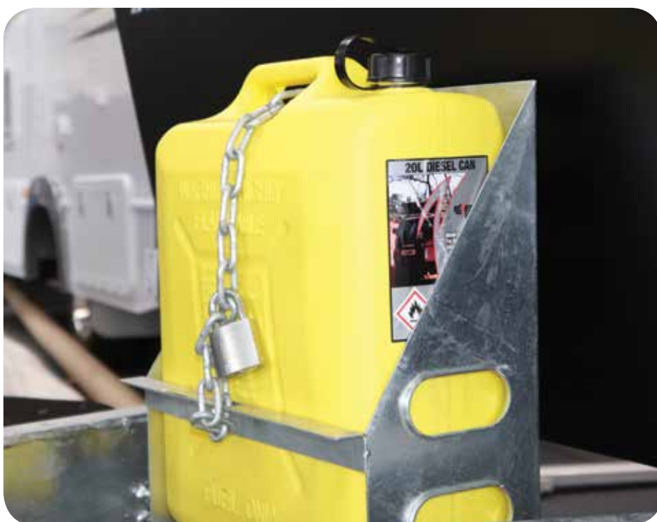
Petrol tin lock

demand, a further 10,000 booklets have been printed.”