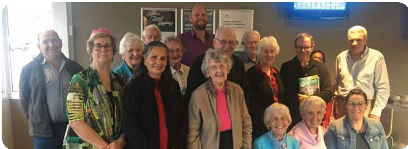
NHW Ambleside Christmas event