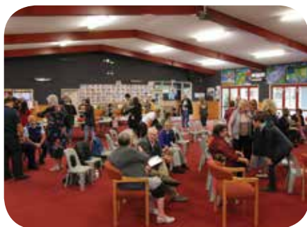
Attendees had the chance to network with WEconnect participants, volunteers, community partners, and neighbours in between trips to the banquet table to sample the amazing dishes on offer

Our communities were made even safer last year with the signing of a Relationship Agreement between Neighbourhood Support New Zealand and Fire and Emergency New Zealand. The agreement sets out guiding principles and shared goals on future collaborations.