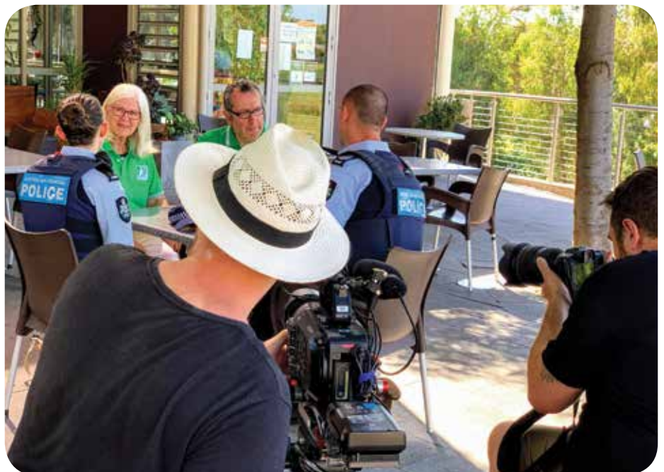
The production team filming the ACT Policing and NHW 'actors'