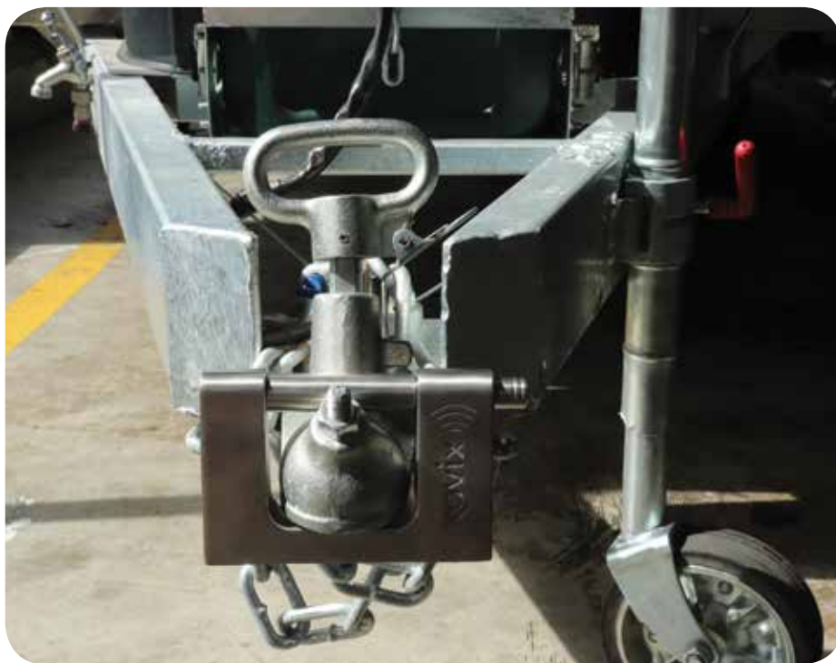
Alarm trailer lock

"We suggest scanning or taking a photo of the property record