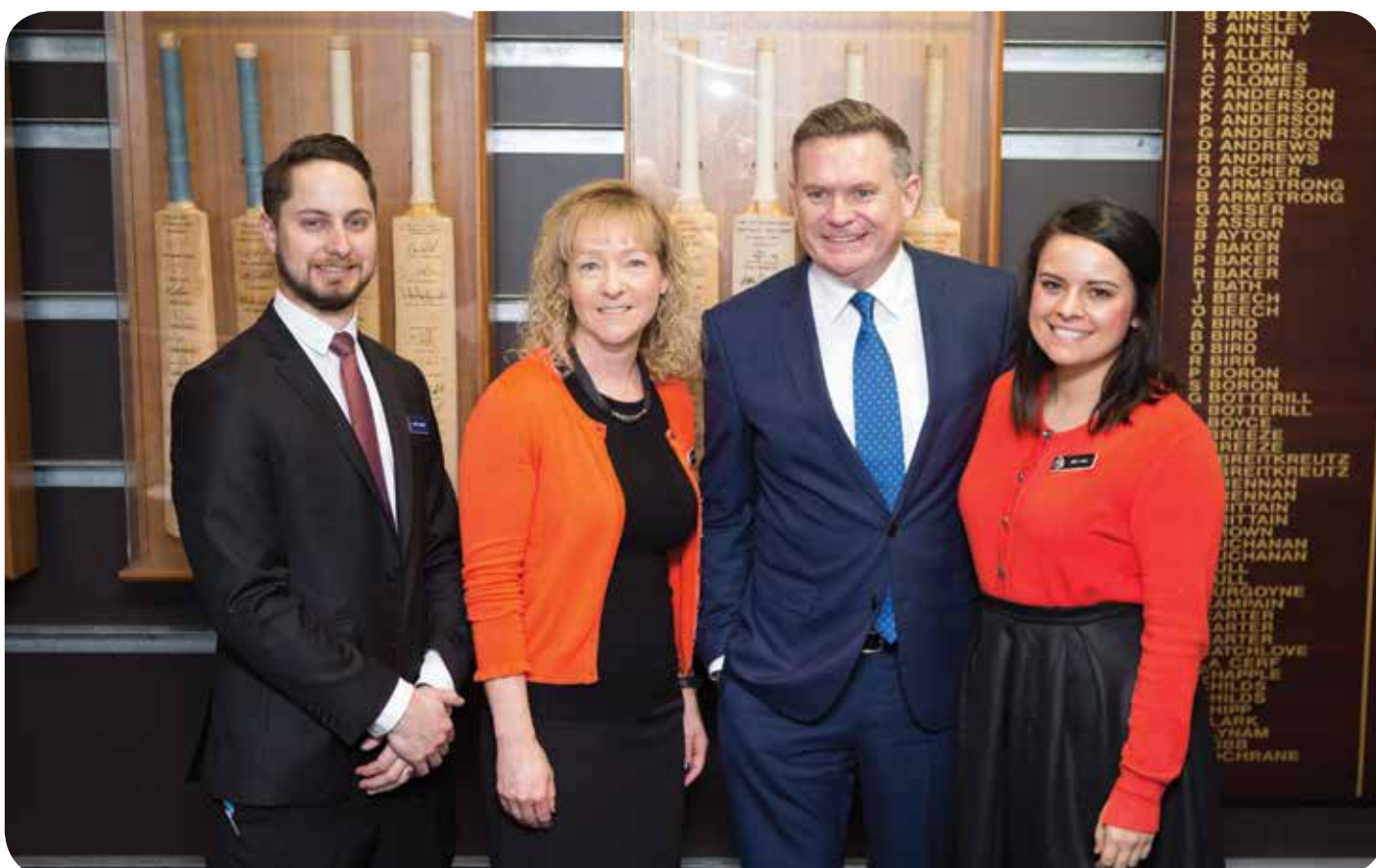
National Missing Persons Coordination Centre members with emcee Michael Usher.

The National Missing Persons Coordination Centre (NMPCC) is a non-operational arm of the Australian Federal Police (AFP). The NMPCC was established in 2006 to drive national coordination in response to missing persons in Australia, and to complement the investigative role of State and Territory police. Its mandate is to reduce the incidence and impact of missing persons in Australia and as a function of the AFP, the NMPCC is funded by the Federal Government.