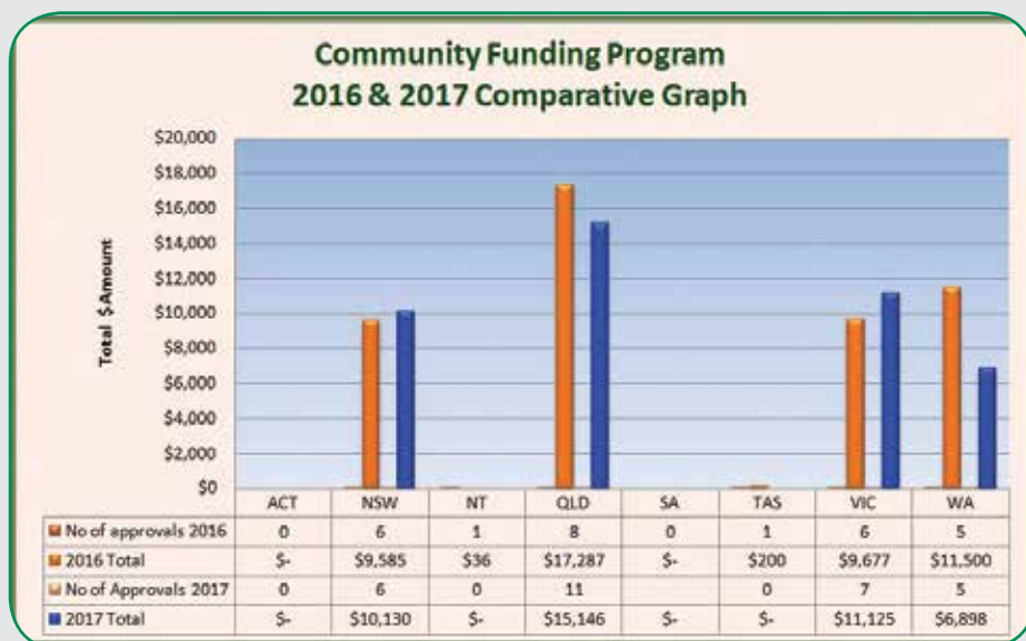
Graph of Community Funding Program projects by State/Territory 2016 and 2017.

NHWA by Thursday 30 November - thanks in advance.