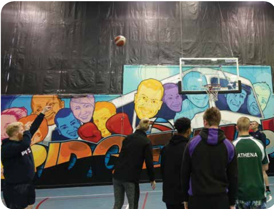
Students from Jordan River Learning Federation, PCYC staff and Tasmania Police recruits have an impromptu basketball game.