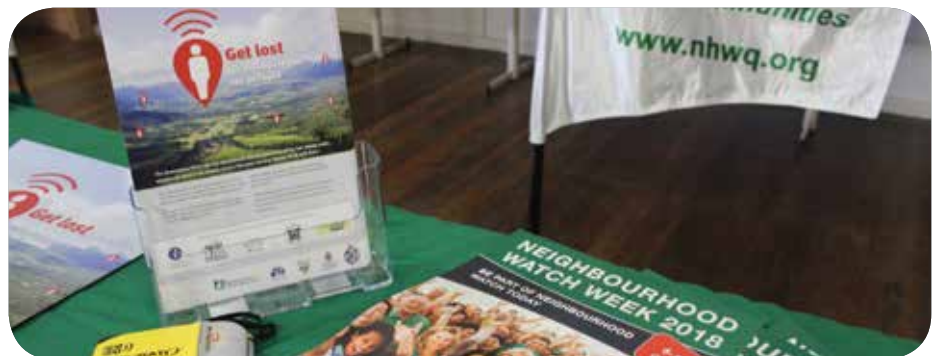
A display table with Neighbourhood Watch and also Personal Location Beacon launch promotional material.

The problem is that the Pioneer Valley is so very gorgeous – it attracts tourists from all over the country and even overseas as a “trekking” destination. There are countless bushwalking trails riddled through the area. Sometimes the bushwalkers have gotten lost, fallen injured or encountered dangerous wildlife and needed to be found.