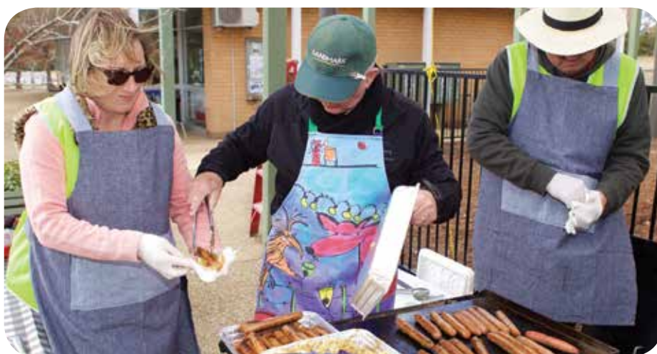
Cooking up a storm for the participants.

Over 20 NHW members helped on the day, setting up, cooking and preparing sausage sandwiches for registrants. The NHW members