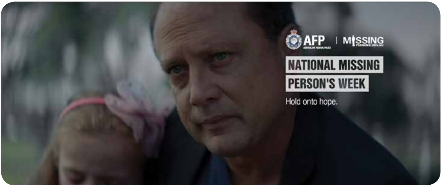
The NMPCC worked with creative company 'Common Ventures' to create an emotive short film and television commercial for NMPW2018.

to help families create public awareness about their loved-one's disappearance, to try to find out what happened, even if the initial interest in the person's disappearance had subsided over the years.