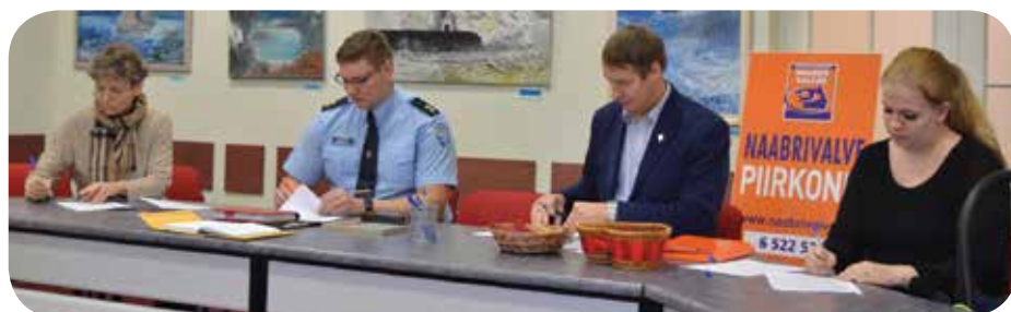
Signing the NHW contract.

After the contract signing the members of NHW district will receive a folder, where we put different kind of advice-leaflets and information booklets about safety, of course there is contact data of their neighbours (the document with important numbers) and