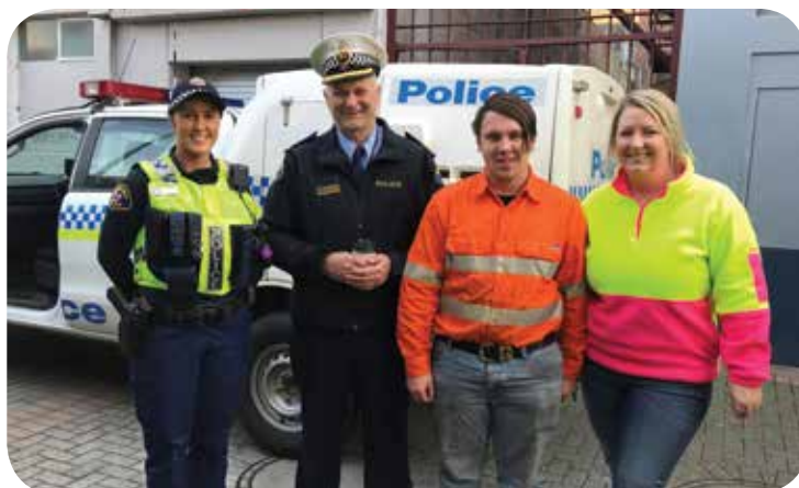
Neighbourhood Watch Week – Cuppa with a Cop, engaging with the community.