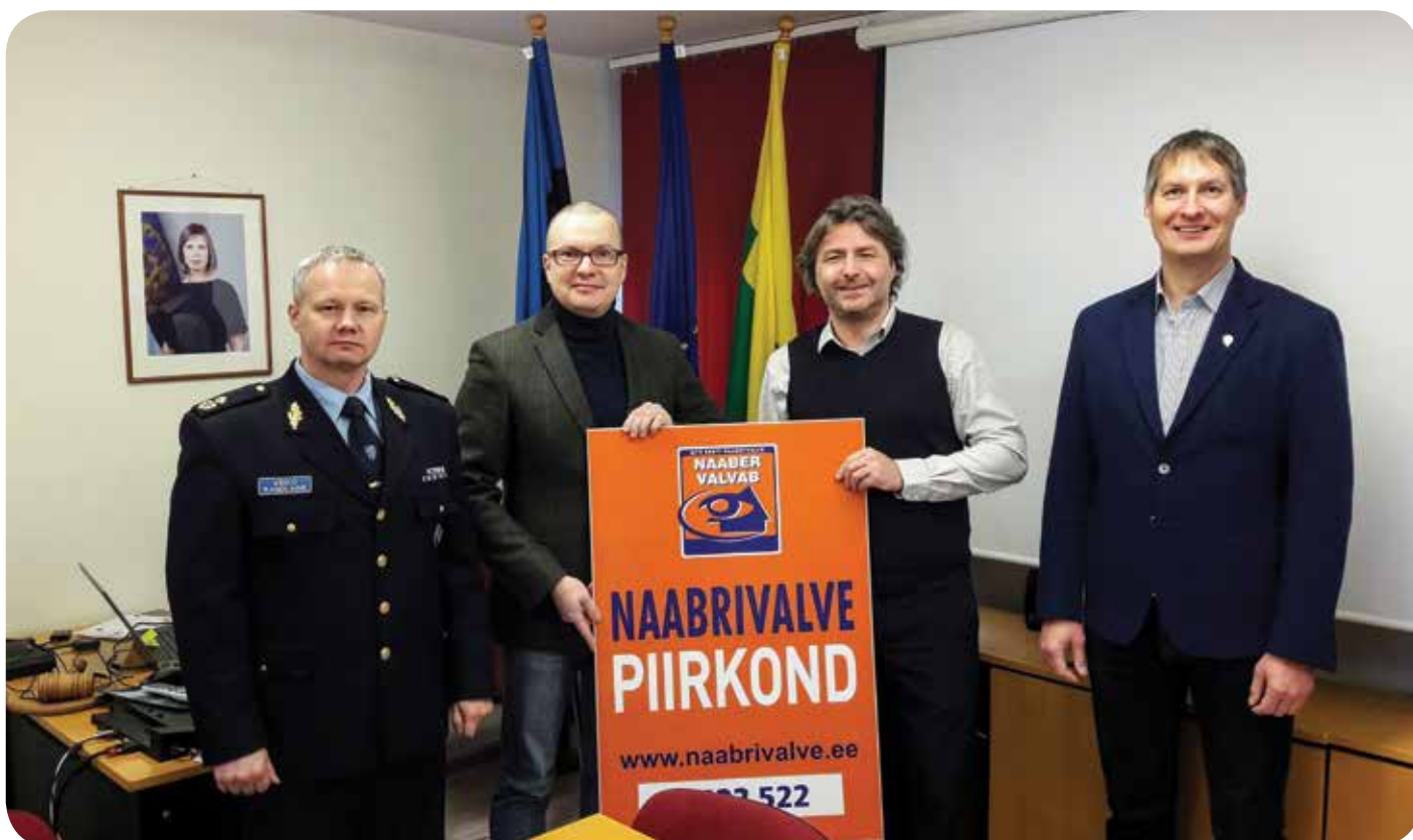
Police, local government, NHW sector and NHW NGO representatives.

Estonia is a small (with the population of 1.3 million people) Nordic country, located by the Baltic Sea.