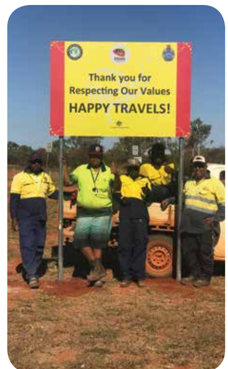
The community sign installation.

Extremely proud of their efforts, community members installed the signs as soon as they arrived in the community.