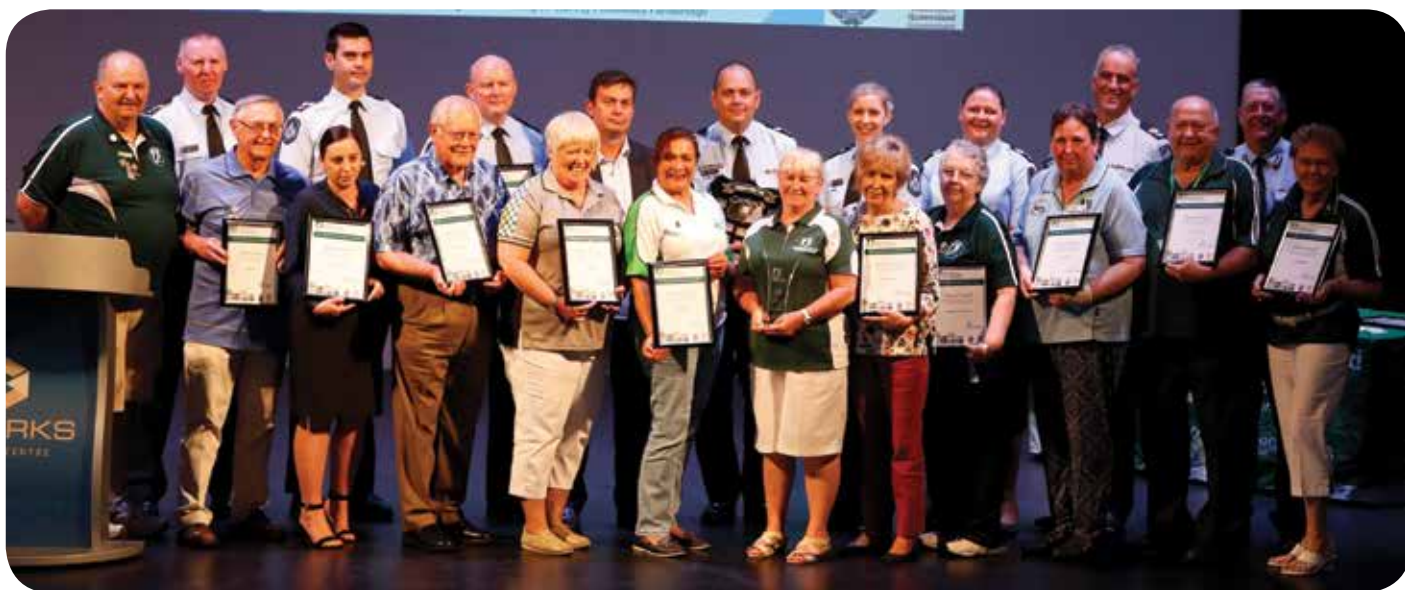
Congratulations to all the NHWQ Award winners.

This year's Neighbourhood Watch Queensland State Conference returned to the Gold Coast to 'Celebrate 30 years of Community Partnerships'. The first Queensland trials of Neighbourhood Watch took place on the Isle of Capri and Sorrento in 1988 and has now grown to over 420 groups state wide.