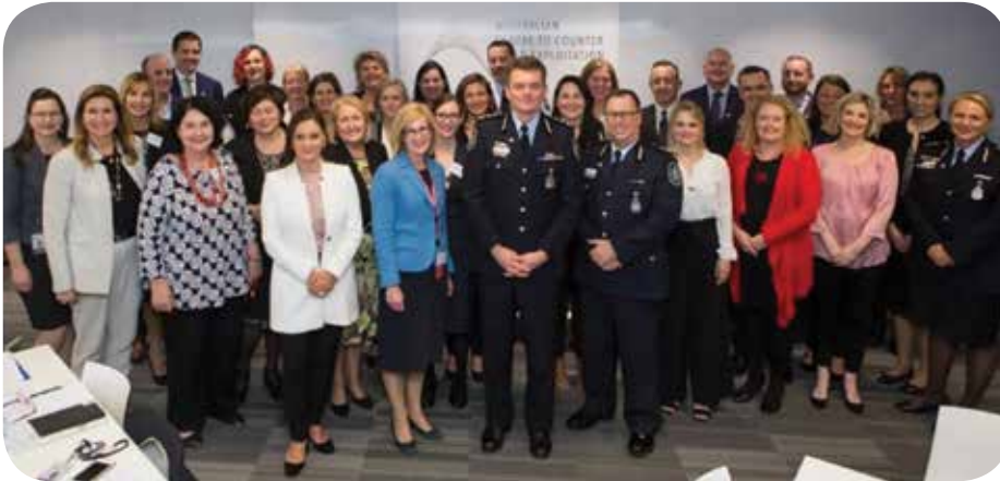
The AFP Commissioner and Deputy Commissioner Karl Kent stand with key stakeholders and the ACCCE Implementation Team.