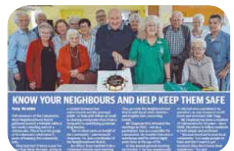
Article published in the Fairfield Advance 10 October.