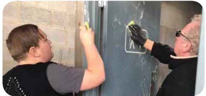
Volunteers hard at work.