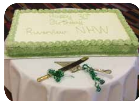
Riverview NHW 30th Birthday cake.

Thank you to the organising Committee for their time and efforts in putting these awards and NHW celebrations together and also to Neighbourhood Watch Australasia for the support of the event through funding obtained to purchase the coffee cups that were provided to all of the award recipients and Neighbourhood Watch members as well as the celebratory chocolates that were provided on each table setting.