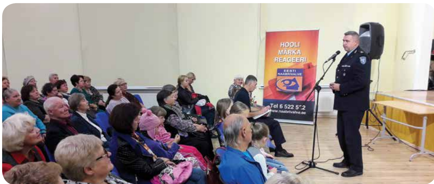
NHW Estonia meeting.

which are important for action. Main preconditions of the NHW activities are that people know each other and also have the contact data of their neighbours. It gives the possibility to notice suspicious activity and contact the neighbour(s) if necessary. So every NHW district starts with collecting the neighbours contact data (name, address, phone numbers, e-mail, car information), usually it is done in the first meeting, where neighbours get to know each other. Each participant confirms with his/her signature that they agree to use this data in the NHW activities. Later this data will be updated at least once a year, but usually after a new member joins or when somebody leaves the NHW sector. The members of NHW district choose a leader, who will represent them in the co-operation agreement, in NHW meetings and will be a