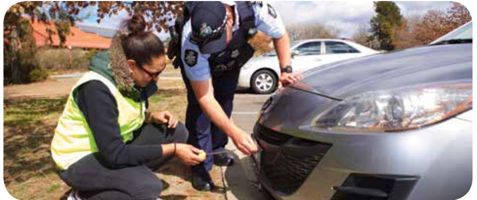
An officer from ACT Policing instructing the fitting of tamper proof screws.