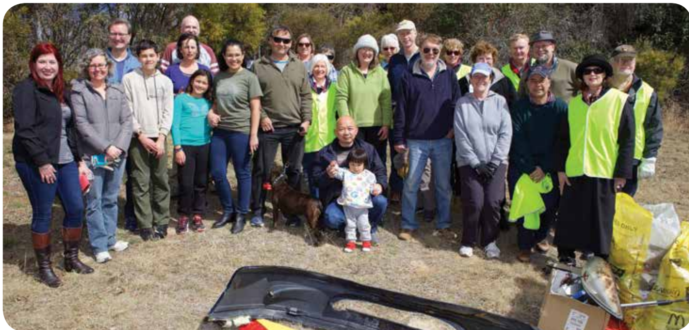
Clean Up Florey Day participants with some of the rubbish collected.