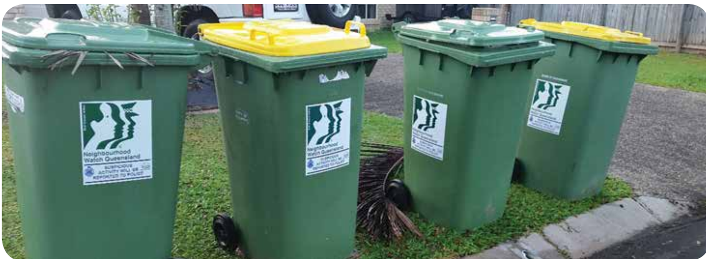
NHWQ Wheelie bin stickers in Brinsmead.