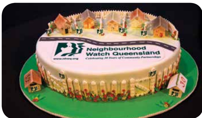
NHWQ cake generously donated by the Gold Coast Branch of the Queensland Cake Decorators Association.