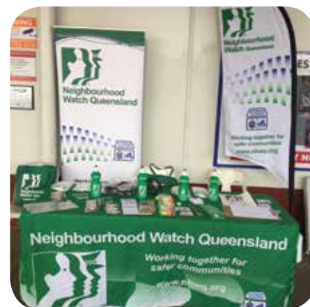
Manunda NHW give-aways at local IGA.

sausage sizzles and cake stalls. Food, the perfect way to create an opportunity to chat to your local community!