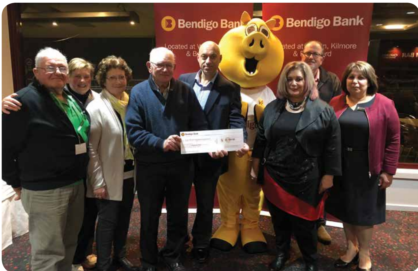
Presentation night at Kilmore Trackside.

With the generous support of the Wallan Kilmore Community branch of Bendigo Bank we have been able to purchase much needed equipment. 2 marquees, full printed wall kits for each, printed valances, several pull up banners, and several tear drop banners.