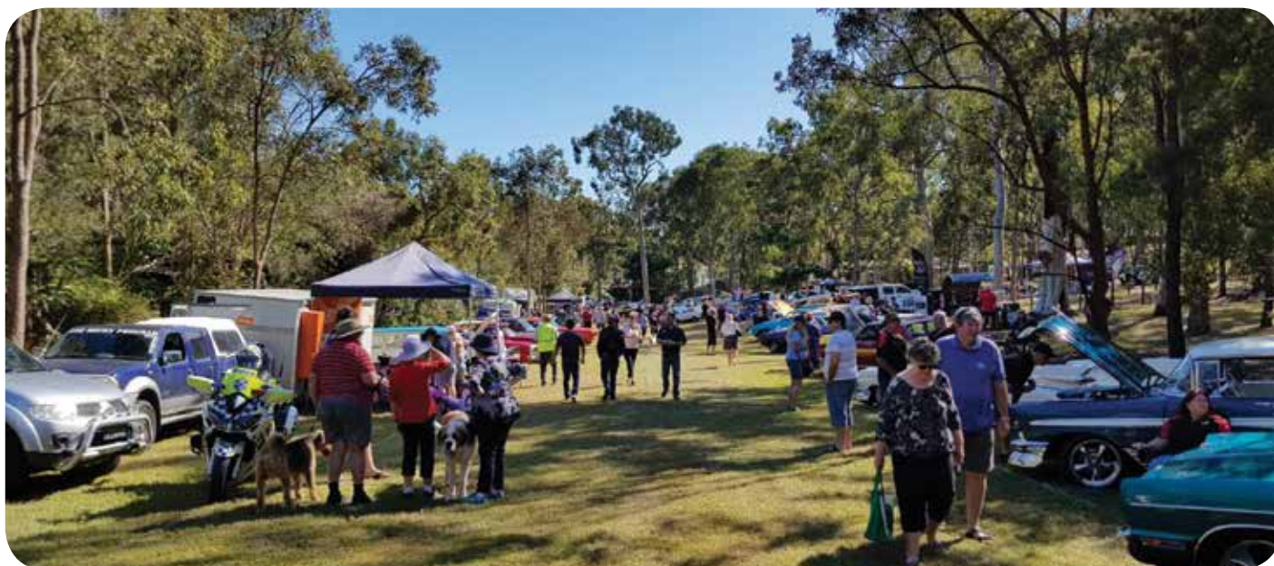
Nearly 100 vehicles packed Lincoln Green Park, ranging from the early 1900s to modern day specials.