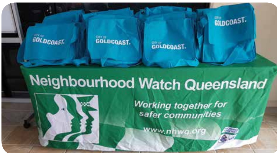
Handouts for residents.

Nerang 8 Neighbourhood Watch held a joint Neighbour Day/ 10th Birthday celebration in March 2018 for their local residents.