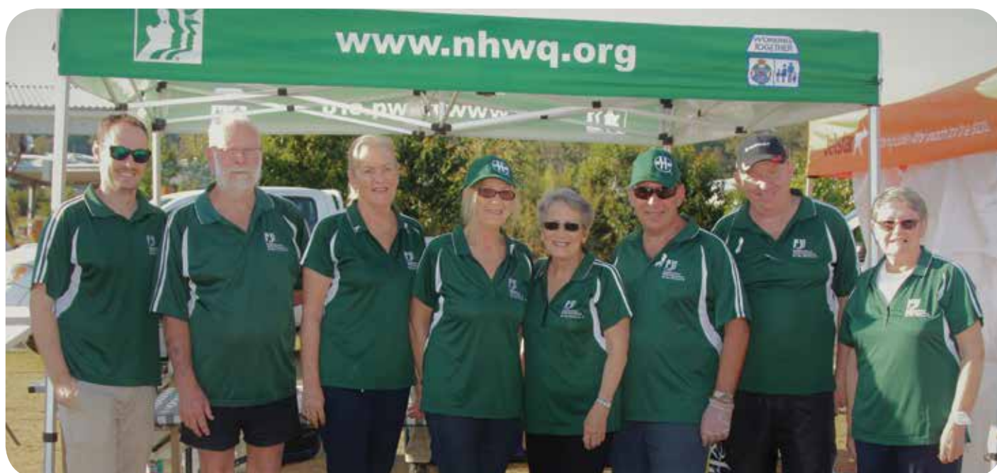
NHW Bli Bli members.