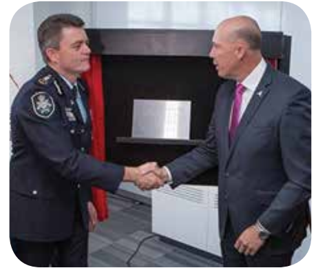
AFP Commissioner Andrew Colvin and Minister for Home Affairs Peter Dutton at the launch of the Australian Centre to Counter Child Exploitation in Brisbane.

Australian law enforcement, including the Australian Federal Police (AFP) is seeing an exponential increase of reports of the exploitation of children involving Australians committing these crimes within our country, as well as increasingly travelling offshore to offend. No region is untouched and no country is immune from this crime. Despite decades of effort, the sexual exploitation of children has expanded across the globe and out-paced every attempt to respond at the national and international level. As well as increasing in volume, the material detected by law enforcement is becoming more extreme.