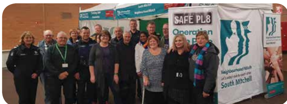
Equipment purchased through the Bendigo Bank grant.

We are extremely grateful to both Bendigo Bank and the Dept. Of Justice for their ongoing support and our local communities will be the winners!