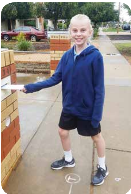
Junior Neighbourhood Watcher delivering crime prevention letters.