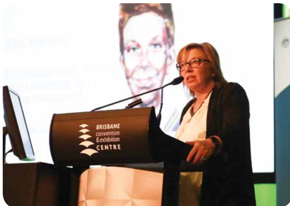
Rosie Batty – 2015 Australian of the Year.