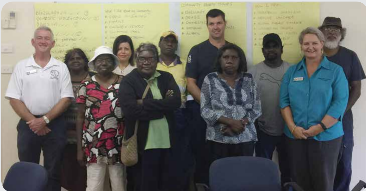
Bidyadanga Community Engagement Group.