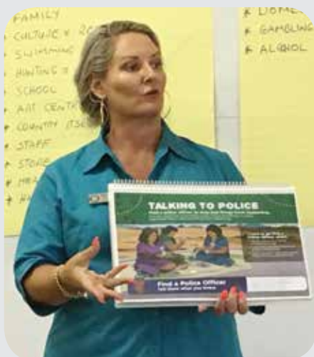
CEO presenting the Speak Up resource.