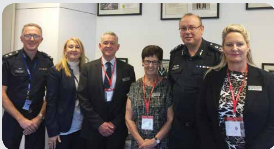
Meeting with VICPOL Commissioner and Deputy Commissioner.

"Working in collaboration with all our member jurisdictions is an important component of creating better business and engagement opportunities across the crime prevention and community safety sector."