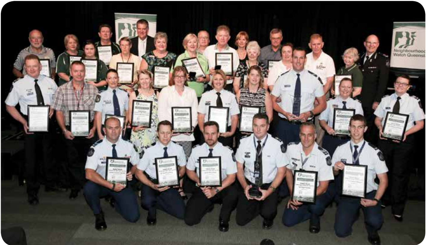
NHWQ Award Winners for Districts: police officers and community members.

The annual Neighbourhood Watch Queensland State Conference was held on Saturday 5 November, 2016, in Brisbane City. The theme for this year's conference was "Strengthen the connection of our neighbourhoods" .